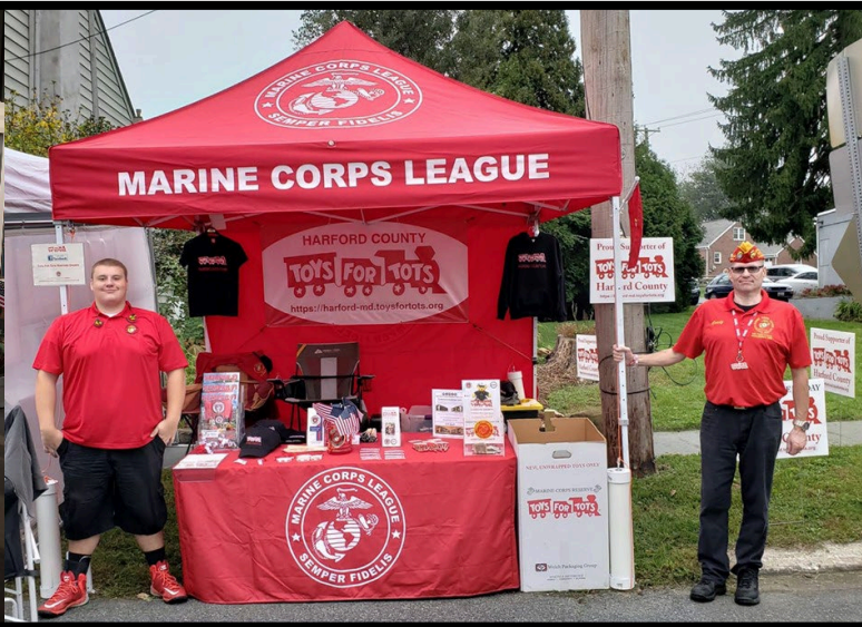
MCL Member & Son with MCL TENT