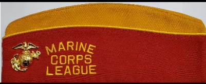
Department (State level)