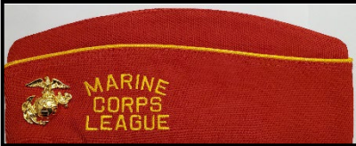
Detachment (Local level)