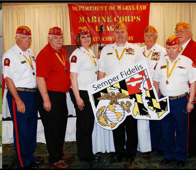
MCL Undress Uniform - White shirt with Dress Blues or Black Trousers