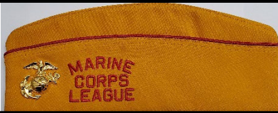
National Officer National Liaison or Committee Member