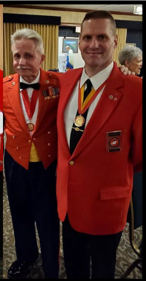
Mess Dress & Red Blazer