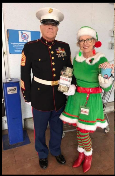
Associate Member & Member MSgt (Ret.) Vietnam War Veteran