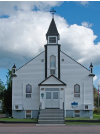
Our Lady of Mercy 11 St. Andrews Street Pointe-du-Chêne, NB