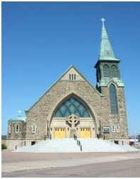
Saint Augustine's 340 Dominion Street Moncton, NB