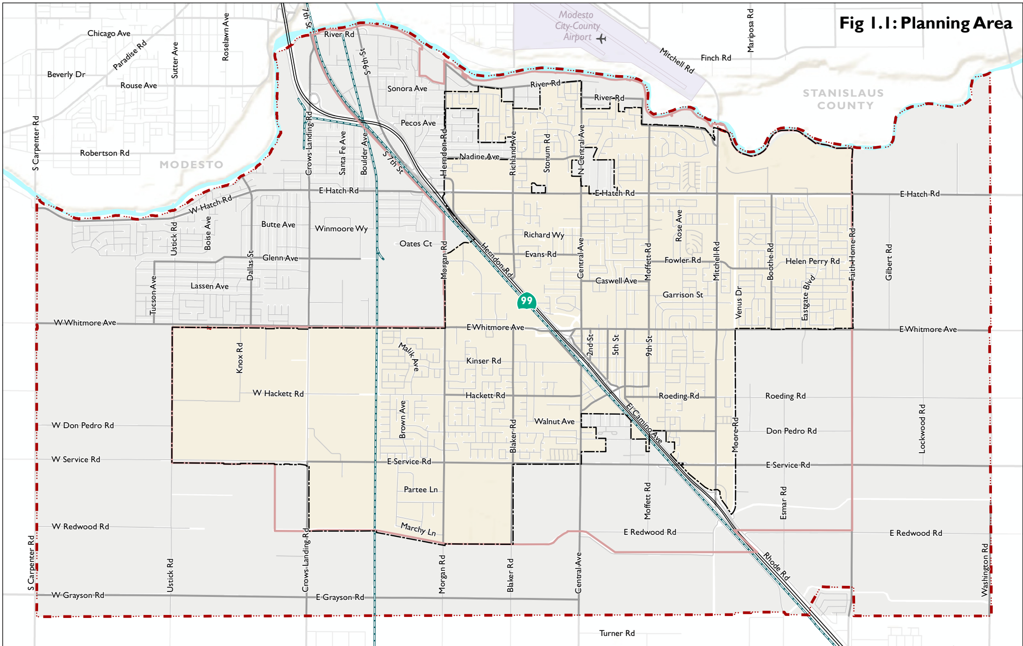
Fig I.1: Planning Area