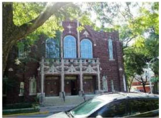
Resurrection Lutheran Church, Chicago

transit to get to worship (for me at Resurrection Lutheran Church, a church serving refugees and is a reconciling church; I enjoyed in the afternoon the grounds of Loyola and the view of Lake Michigan for my academic studies).