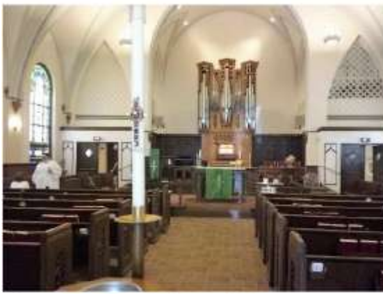
Resurrection Lutheran Church, Chicago

people in the first place... - this was Canada-Day – July 1 st 10 hrs.)