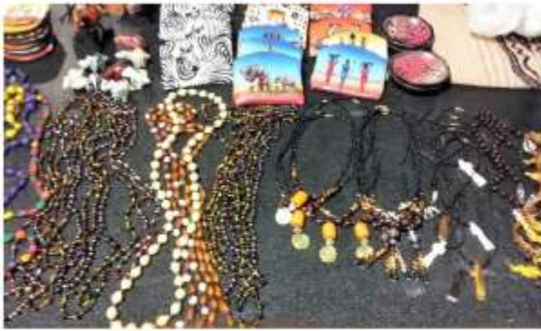
A view into the crafts of Africa – the Sunday School kids get bookmarks from Kenya...

Shaken by the wind –Wednesday- to be gathered together and left behind our daily routines to assemble..., (My experiences: Filling many of the 400 registration bags, several times with the needed material, added the registered people from “E-L” from for 10 hrs. – 7 people did not receive the permission to enter the USA, including one from Germany.)