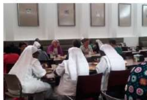
Deaconess Sisters from India