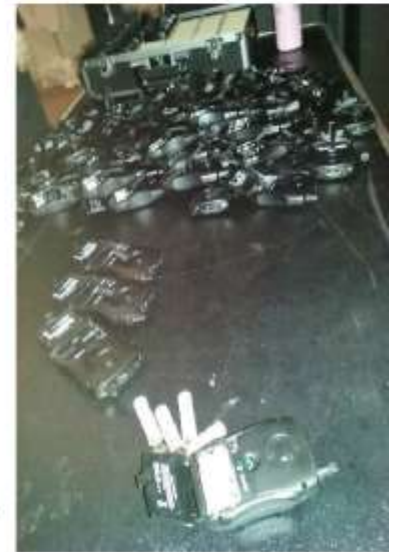
Receiving units during battery change, one case of the many in the background.

it done with 30 min. to spare before the evening worship started! Contemplation: is it appropriate to celebrate your national holiday, since the country belongs to the indigenous