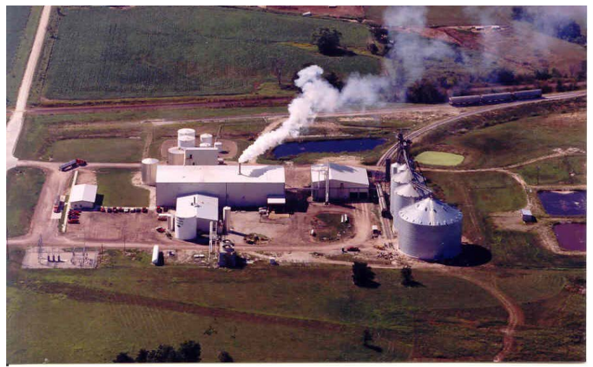
Ariel View of POET Biorefining Site

ETHANOL PLANT ENERGY SAVINGS: 15–25% reduction in natural gas steam producing costs AVOIDED OUTAGES: Ethanol plant maintained operation during numerous grid outages since 2003 BEGAN OPERATION: 2003