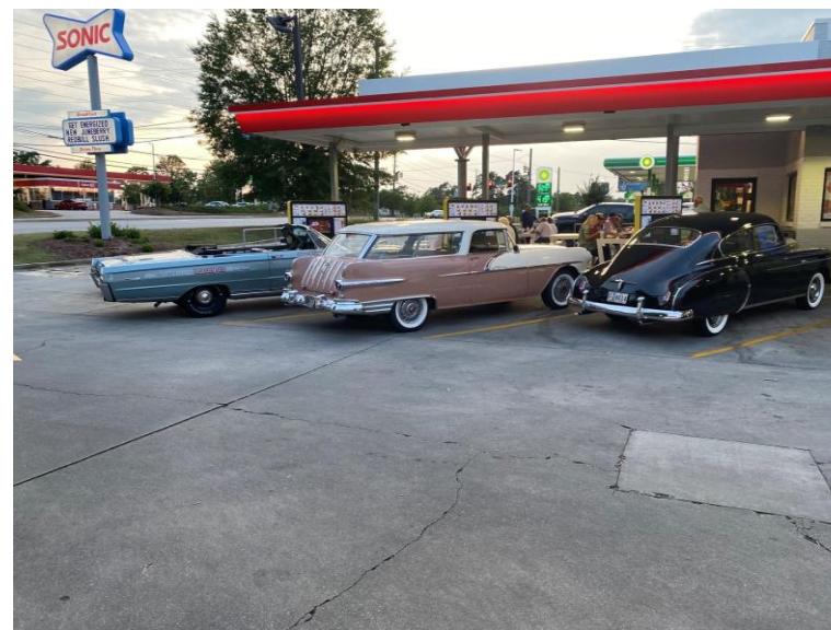
GaSCar at Sonic