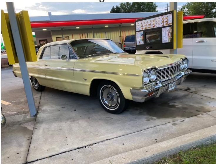
Ralph's 64 Chevy at Sonic