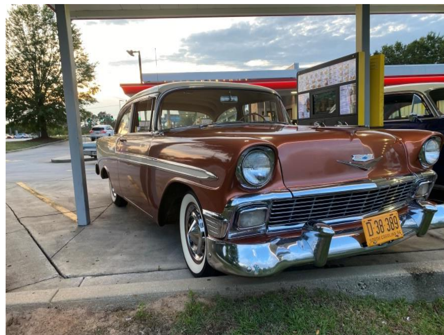
Harold's 1956 Chevrolet at Sonic