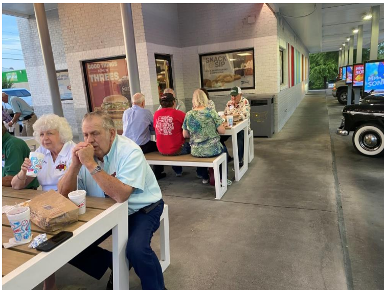
Eating at Sonic