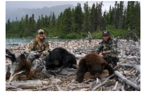
2018 CREW AND AWARDS PAGE 6