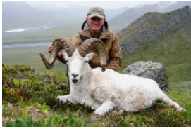
2018 ARCTIC REFUGE SHEEP HUNTS PAGE 2