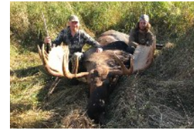
2018 TOGIK REFUGE MOOSE/ BEAR PAGE 5