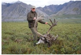
2018 ARCTIC GRIZZLY CARIBOU COMBOS PAGE 2