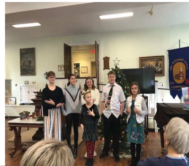
Children's Christmas play with adult help !