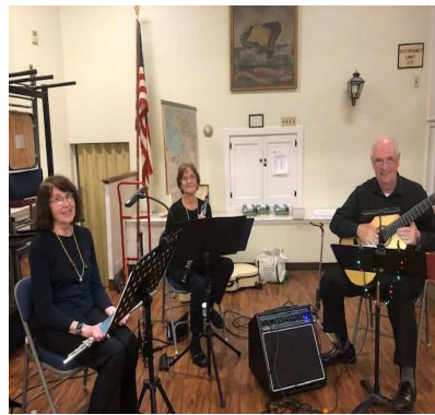
Family night with entertainment.