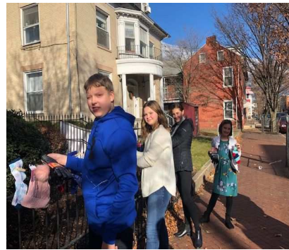
Party after walking and caroling at Penn Hall.