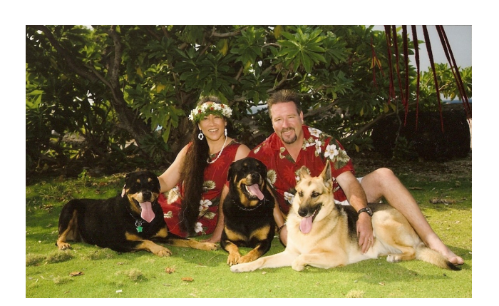
As They Are Trained, So Shall They Perform