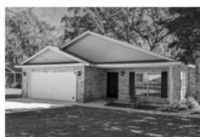
34232 Kathryn Dr., Lillian, AL $368k