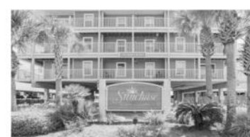
SUNCHASE#211 SOLD IN 3 DAYS! | $385K