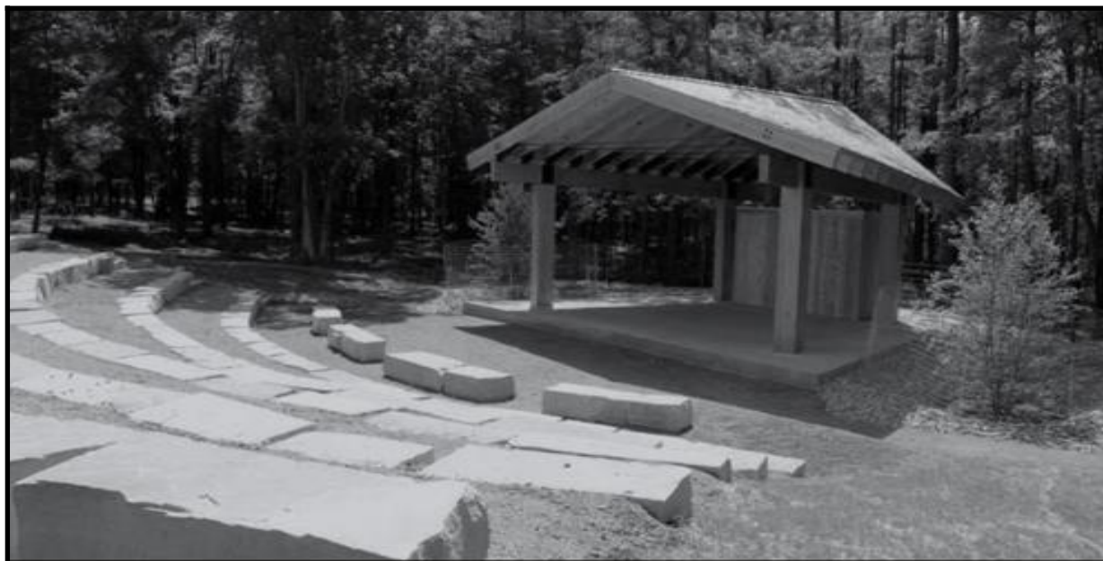
Above, proposed outdoor theater planned as part of the KOA renovation and construction planned by new owners Kleban Properties. Below is an image of proposed guest quarters in a unique tree-house style.

NEW LOCATION 9717 Co Rd 91 Lillian, AL 36549