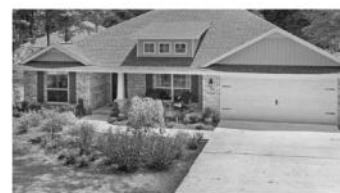
13166 Hulbert Ct., Foley, AL SOLD IN ONE DAY! | $282K