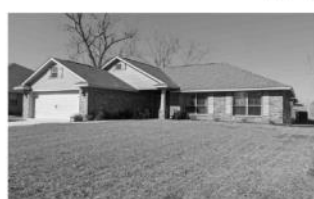
13167 Hulbert Ct., Foley, AL $308k