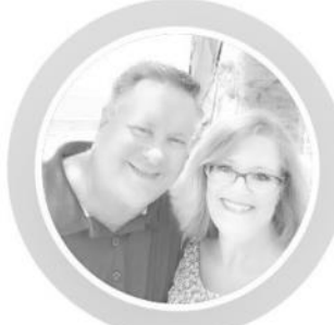
THE GREEN TEAM ASSOC BROKER/REALTOR 251-222-5626