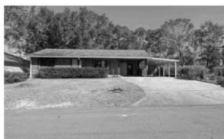
2857 Avenida Alberto, Lillian, AL $258k | Sold AS IS