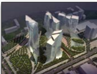
Dostyk Project, Almaty - NBBJ with E/YE Design