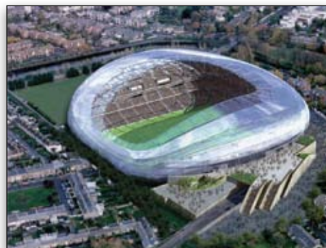
Lansdowne Road Stadium, Dublin - HOK and Buro Happold