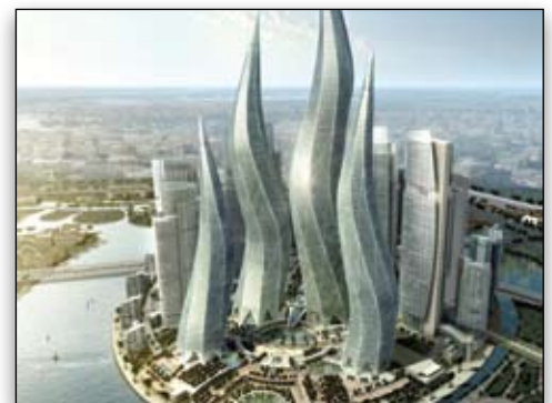
The Lagoons - Thompson Ventulett Stainback and Associates