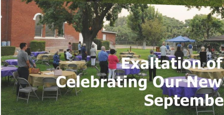
Exaltation of the Holy Cross Celebrating Our New Priest - Der Mashdots September 13, 2020