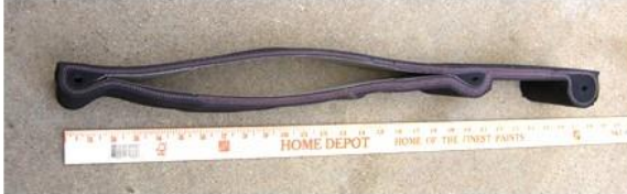
A 4 ply reinforced seal inflated with water forms a structural non-compressible bag (Oval)