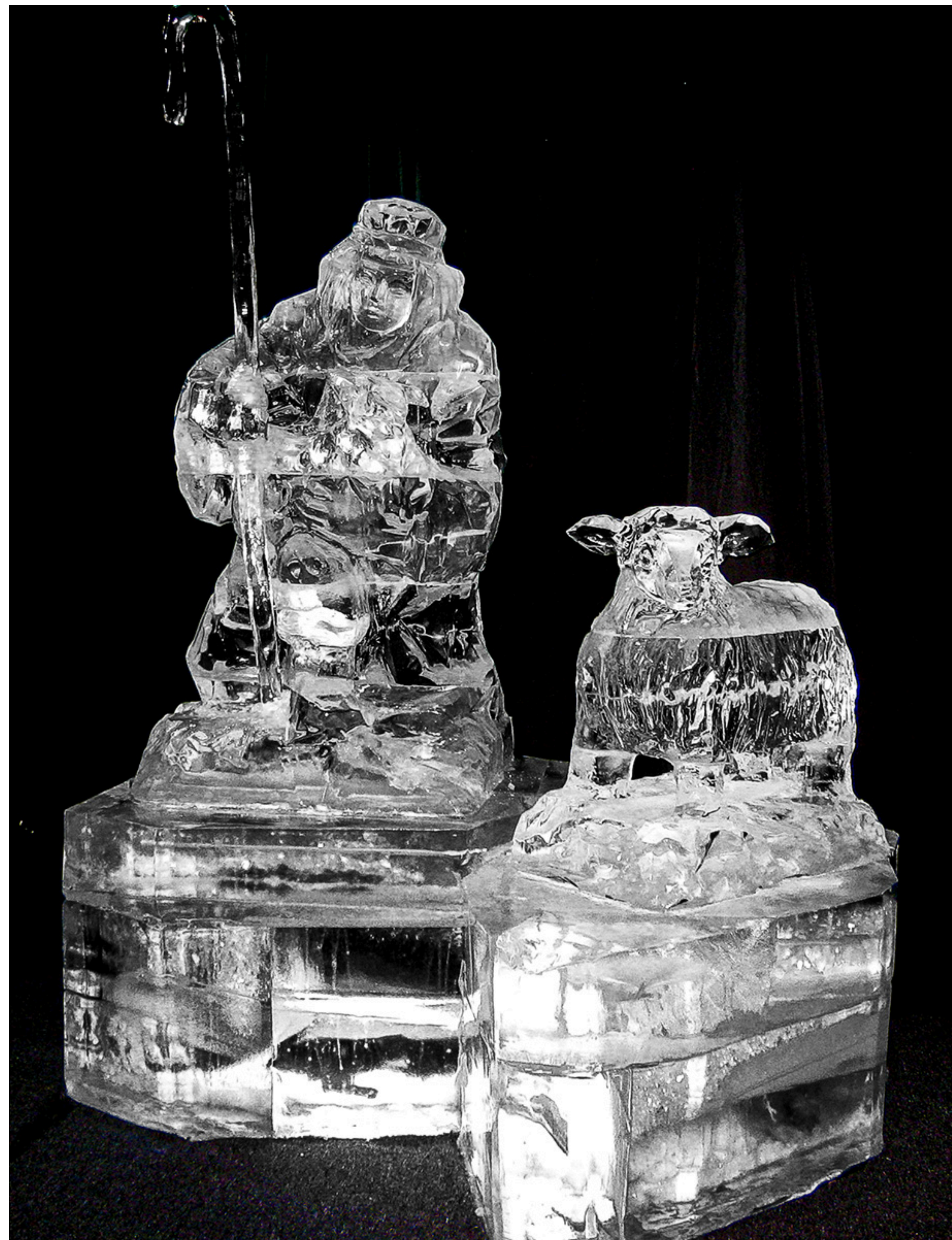
Entry - 2