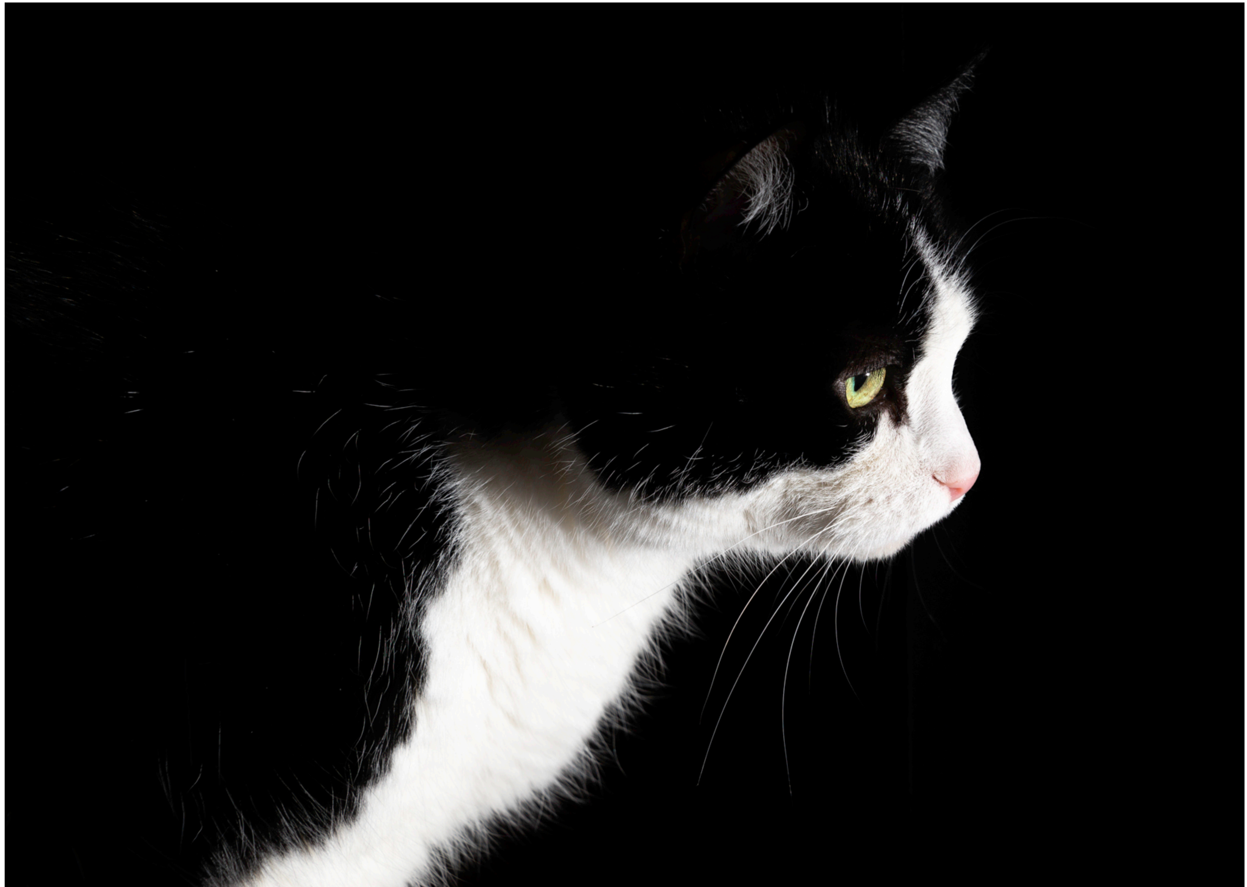
Entry - 16