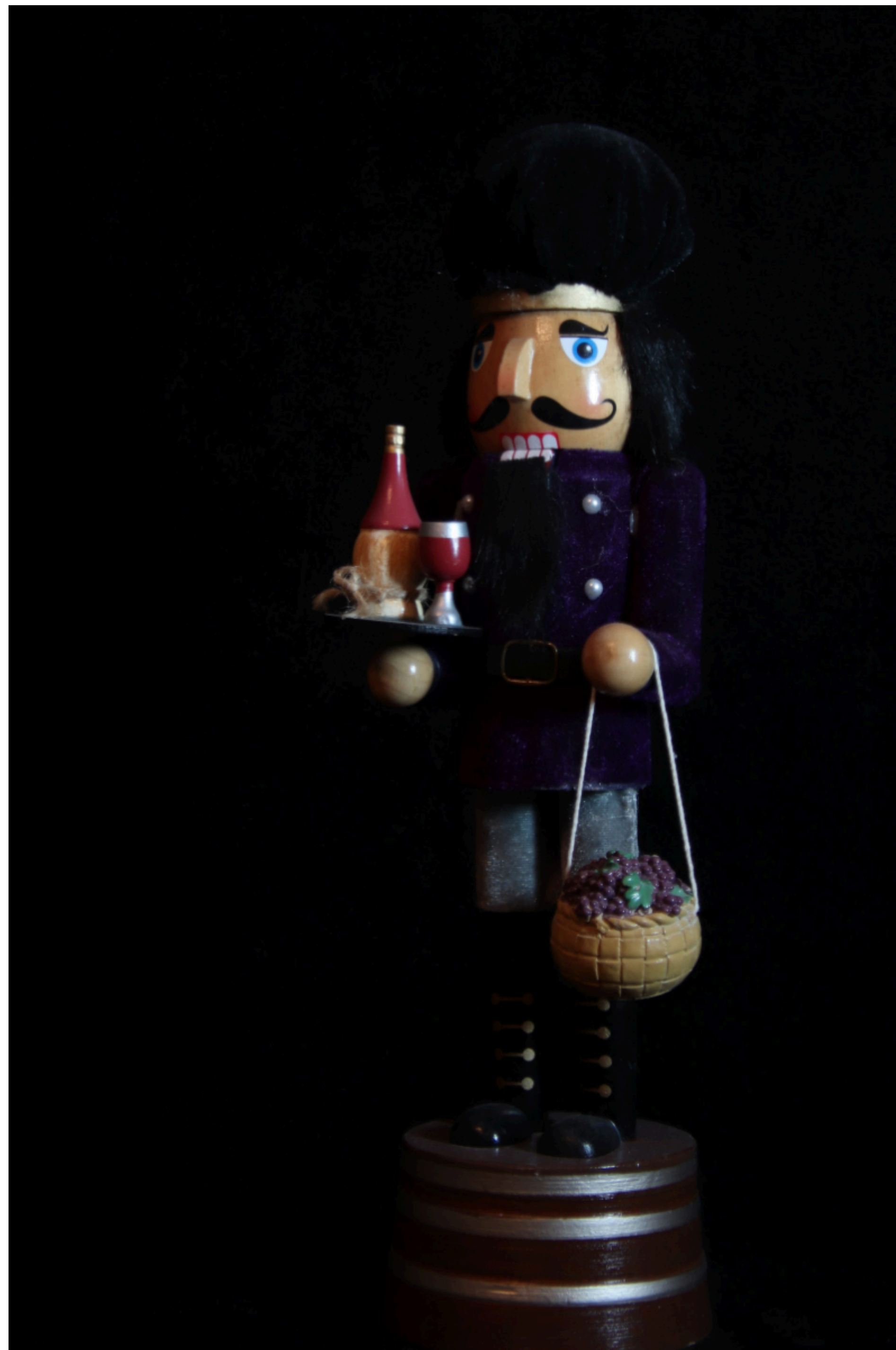
Entry - 12