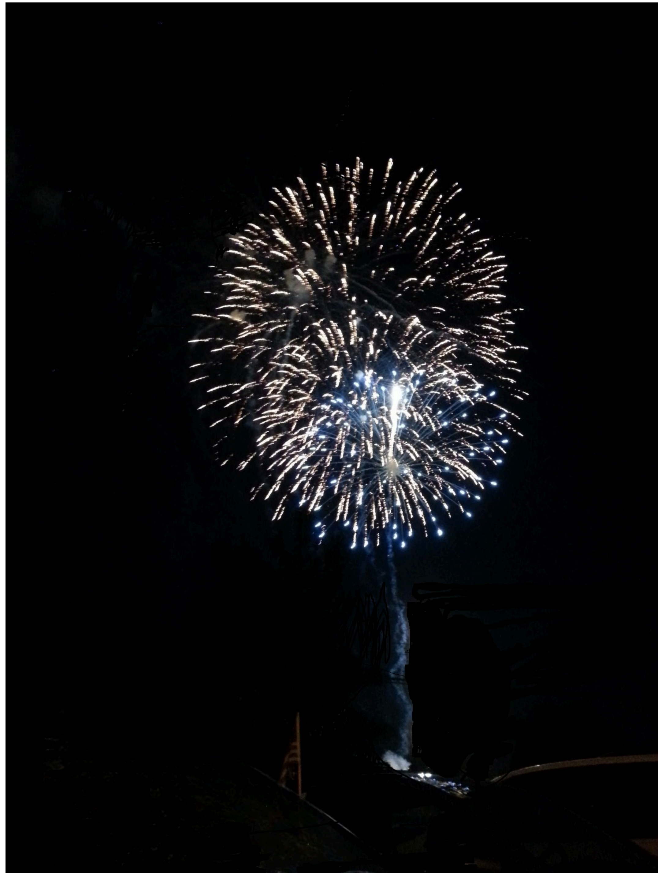
Entry - 1