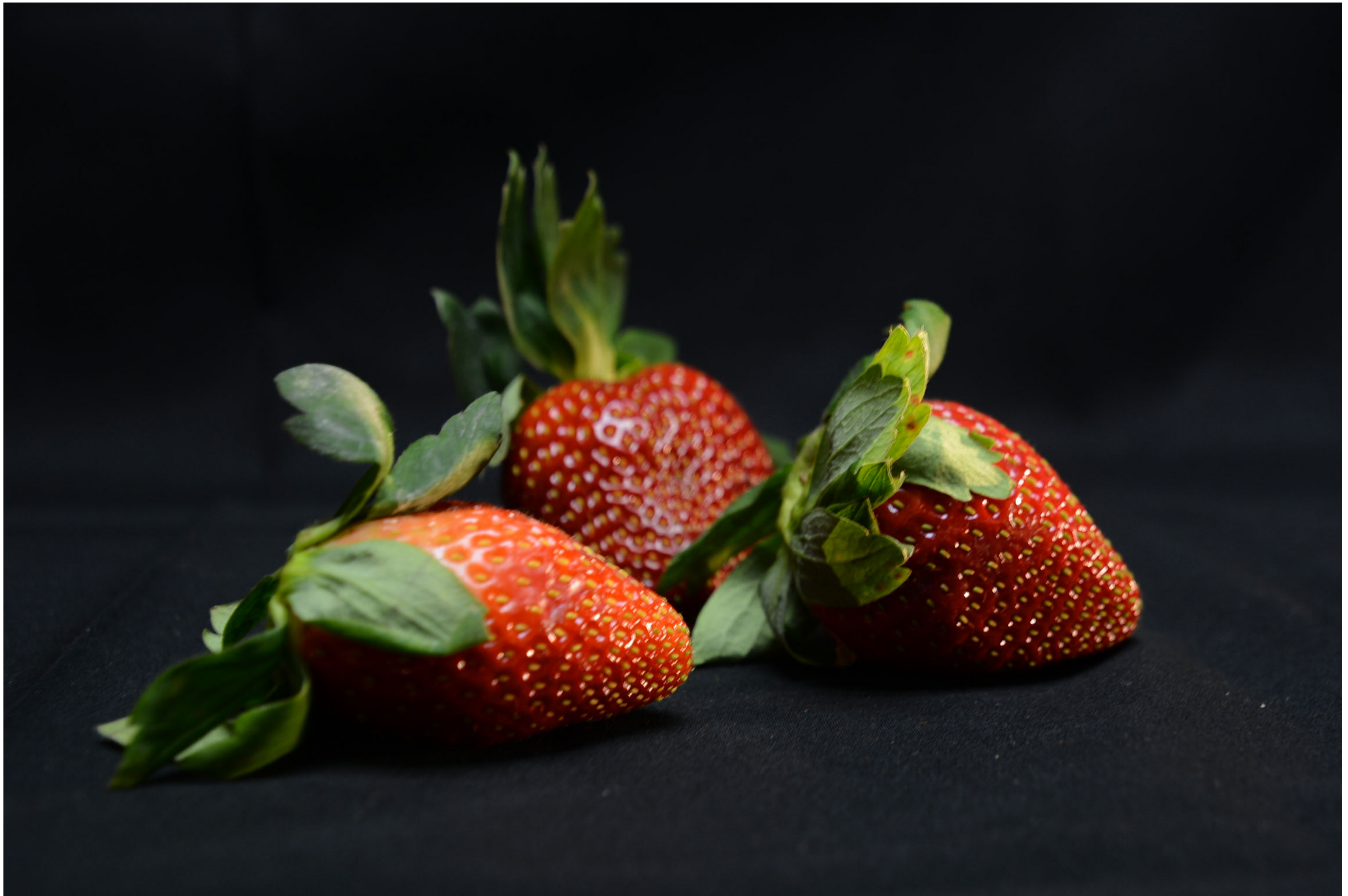
Entry - 10