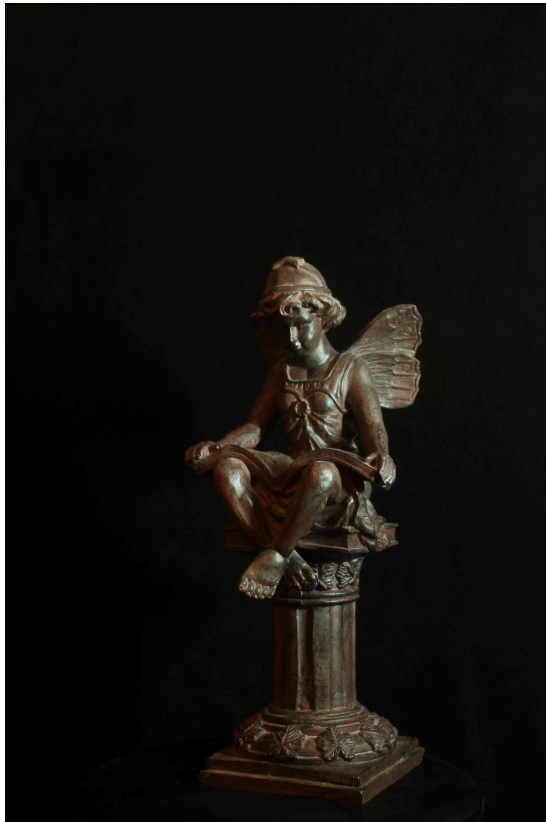
Entry - 13