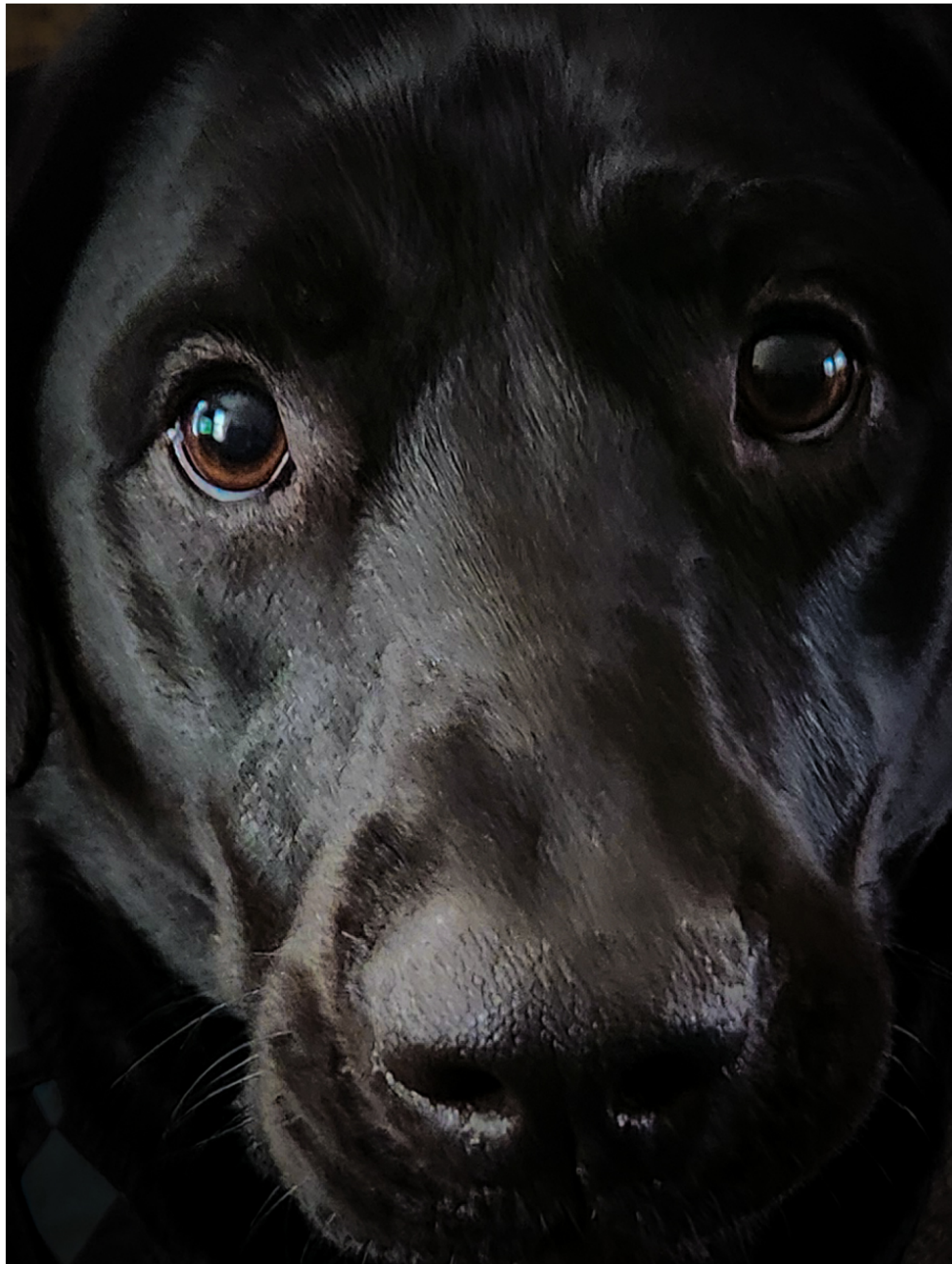
Entry - 7