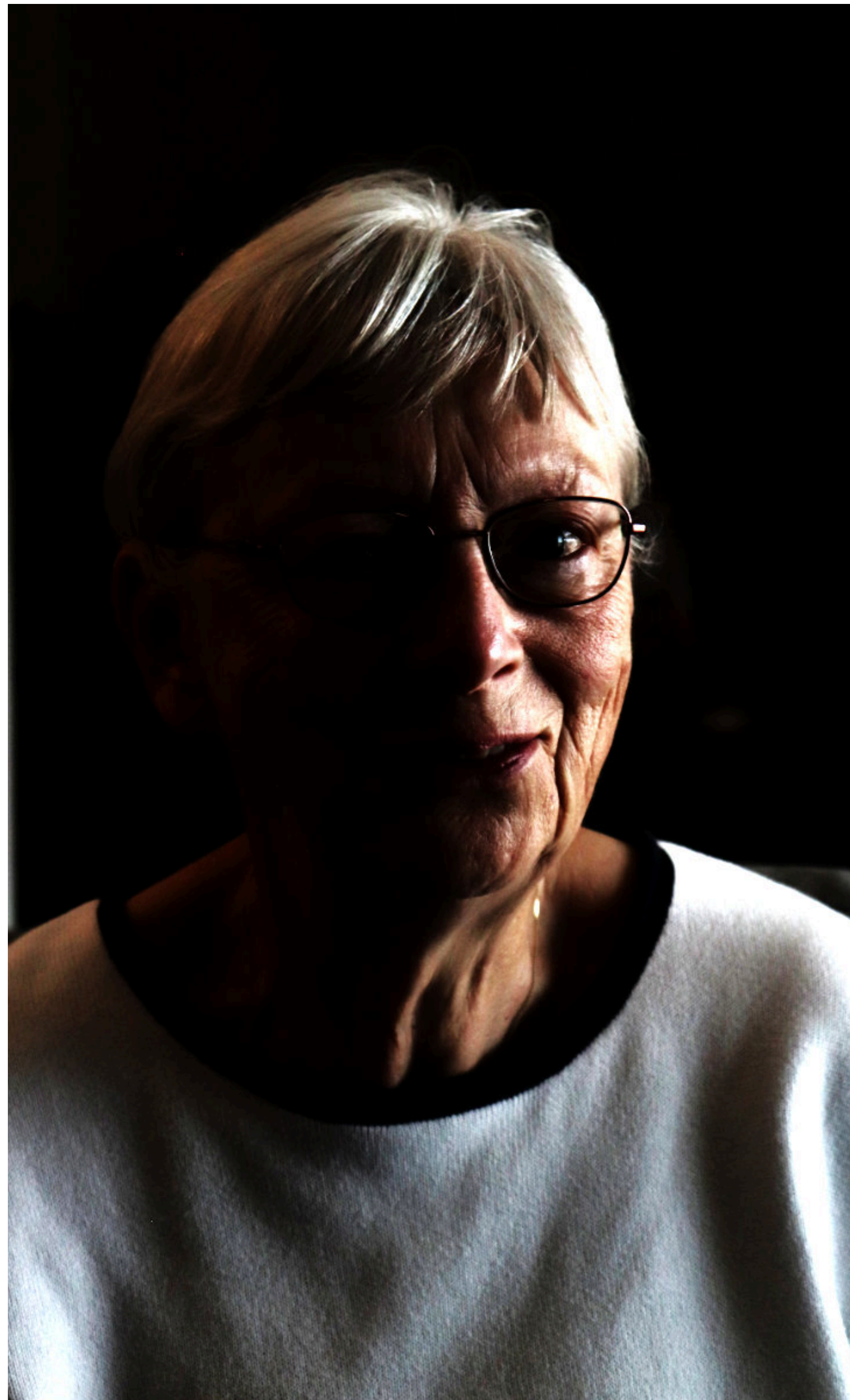
Entry - 14