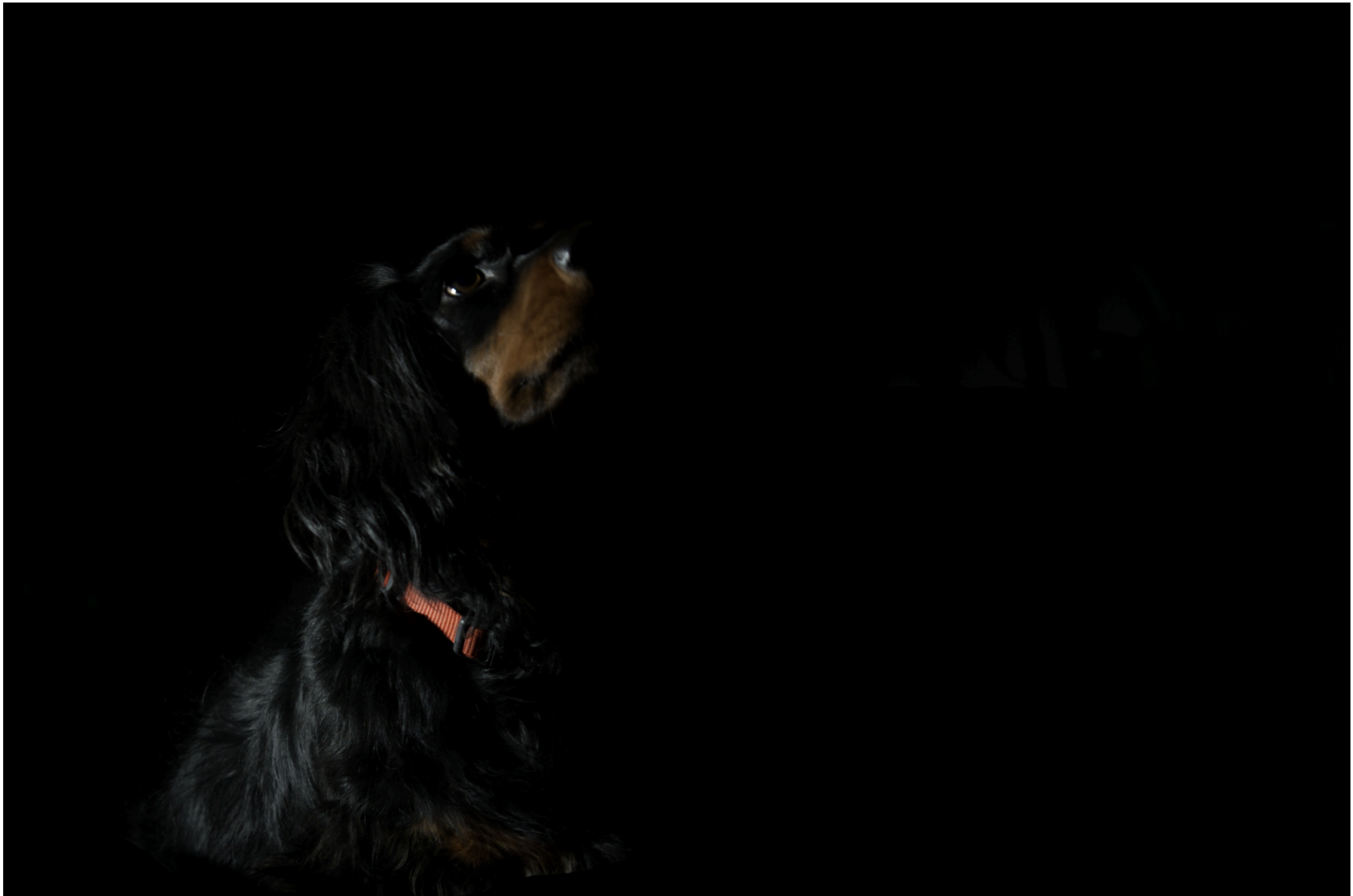
Entry - 15