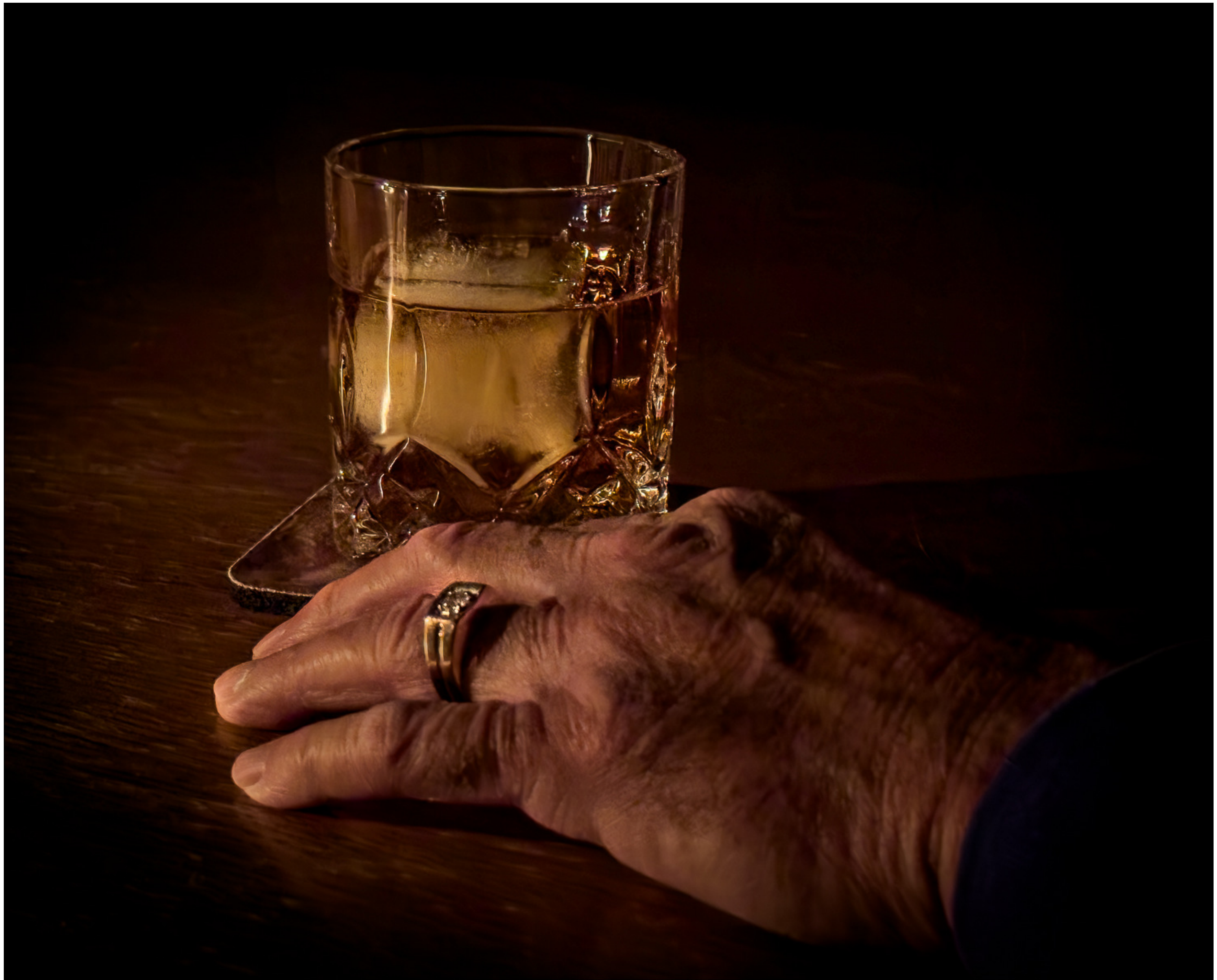
Entry - 5