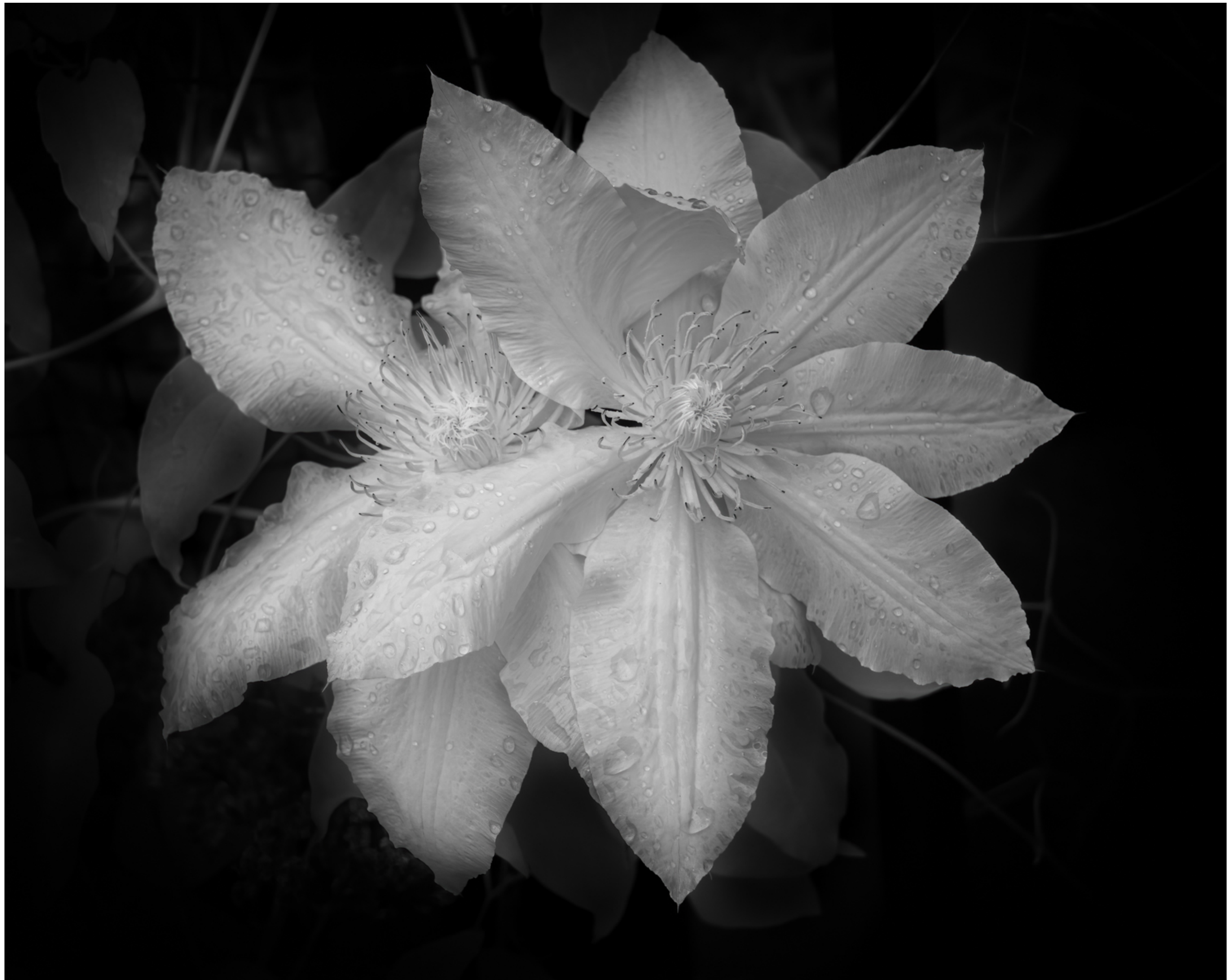
Entry - 3