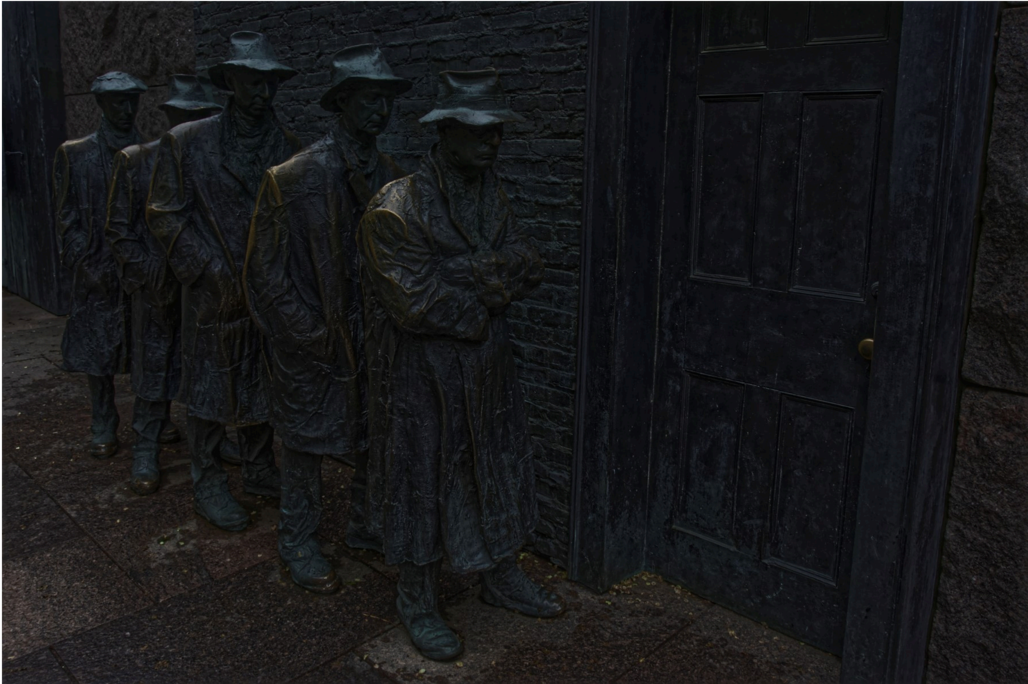
Entry - 9