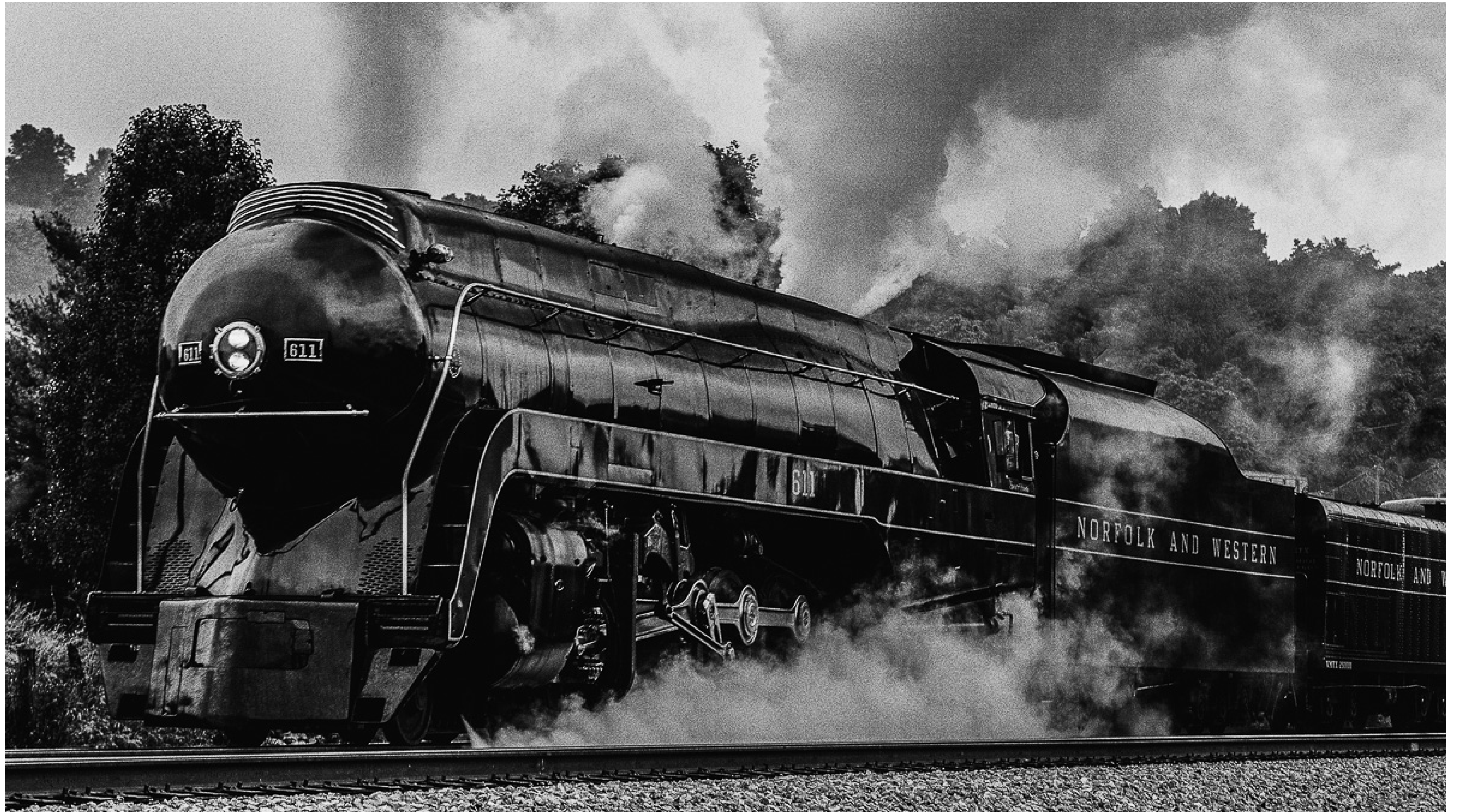
Entry - 8