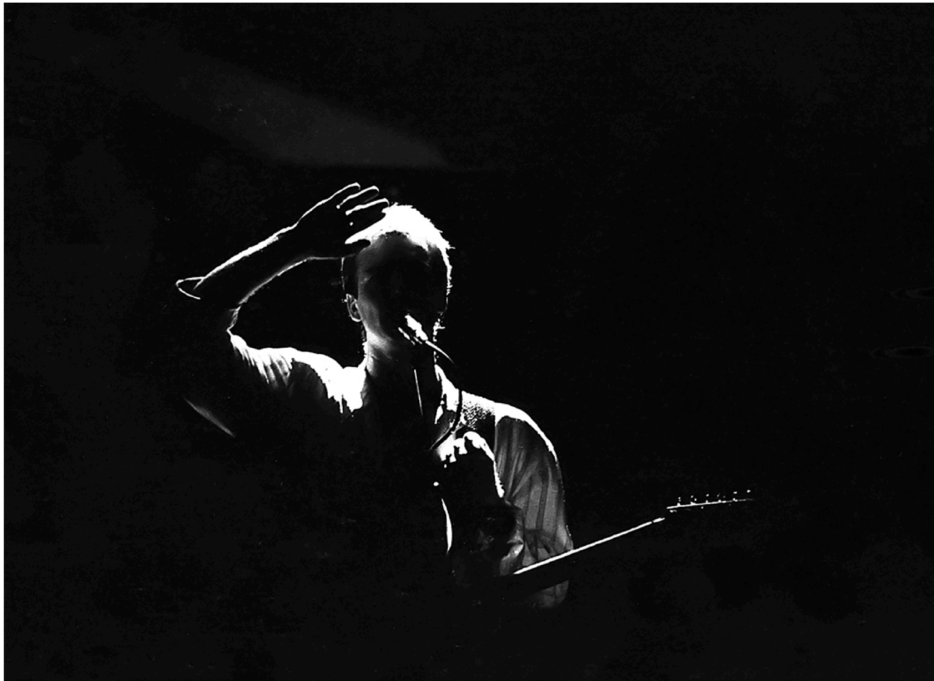
Entry - 11