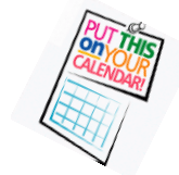
Table and Chair Sign-Out

February 3 rd – Annual Meeting March 3 rd – Men’s Breakfast March 10 th – Youth Progressive Dinner March 22 nd – Dinner & Game Show