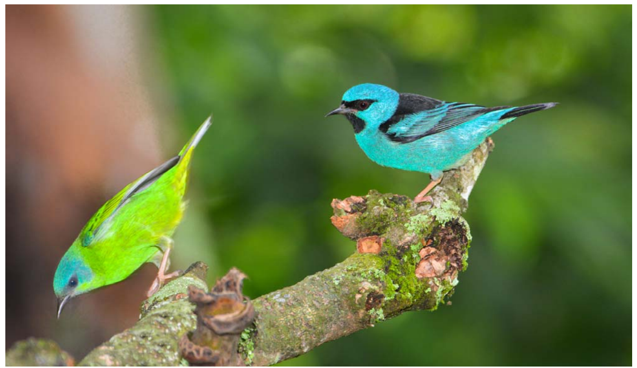
Blue Dacnis (male & female) [Lodge garden]