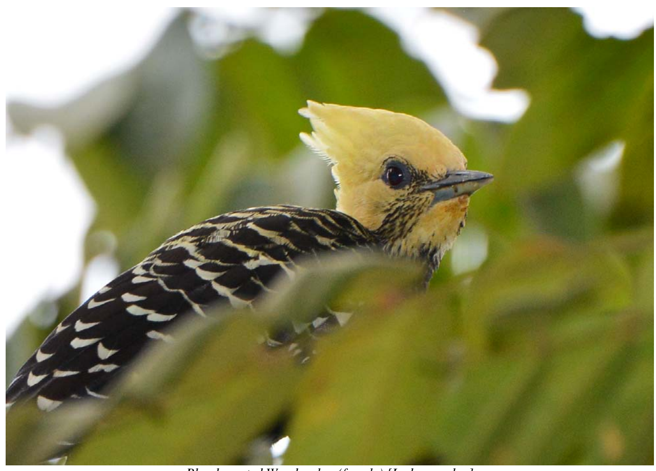
Blond-crested Woodpecker (female) [Lodge garden]