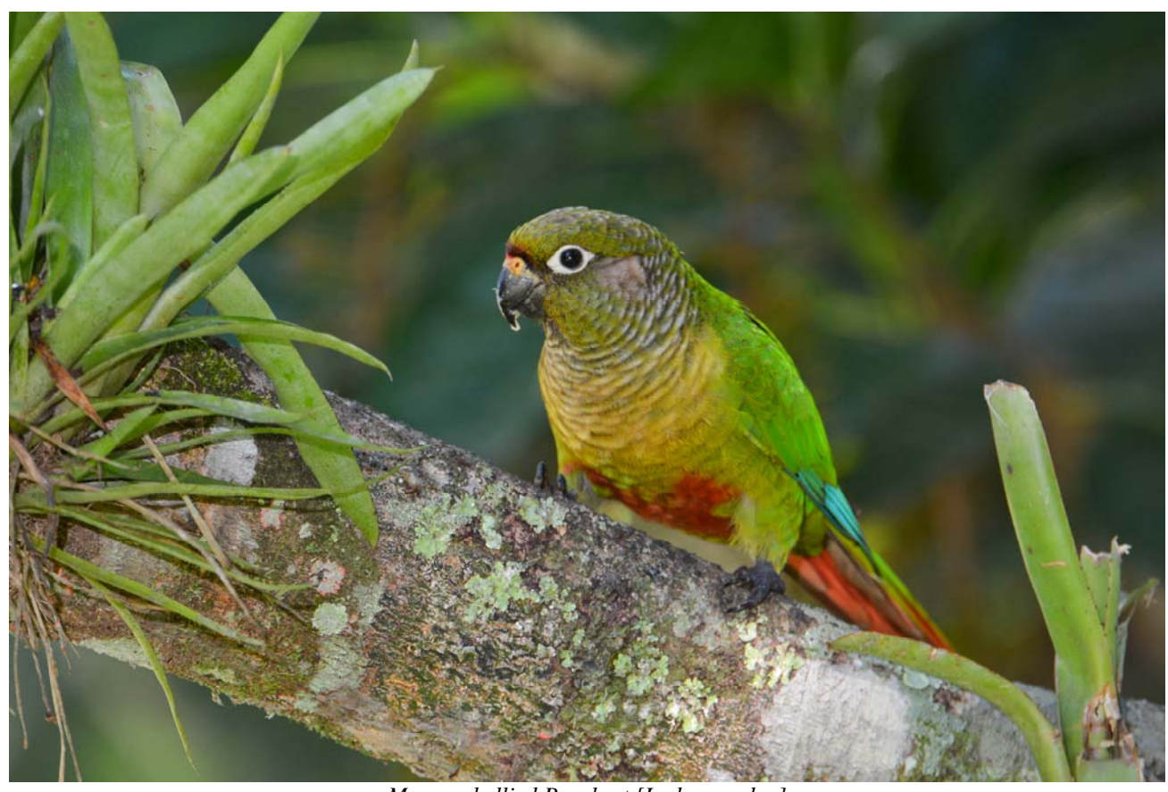
Maroon-bellied Parakeet [Lodge garden]