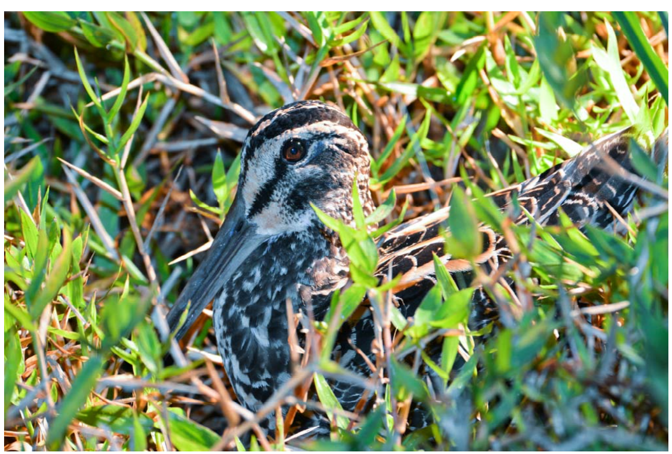
Giant Snipe [Spotlight after dark in fields near to the lodge]