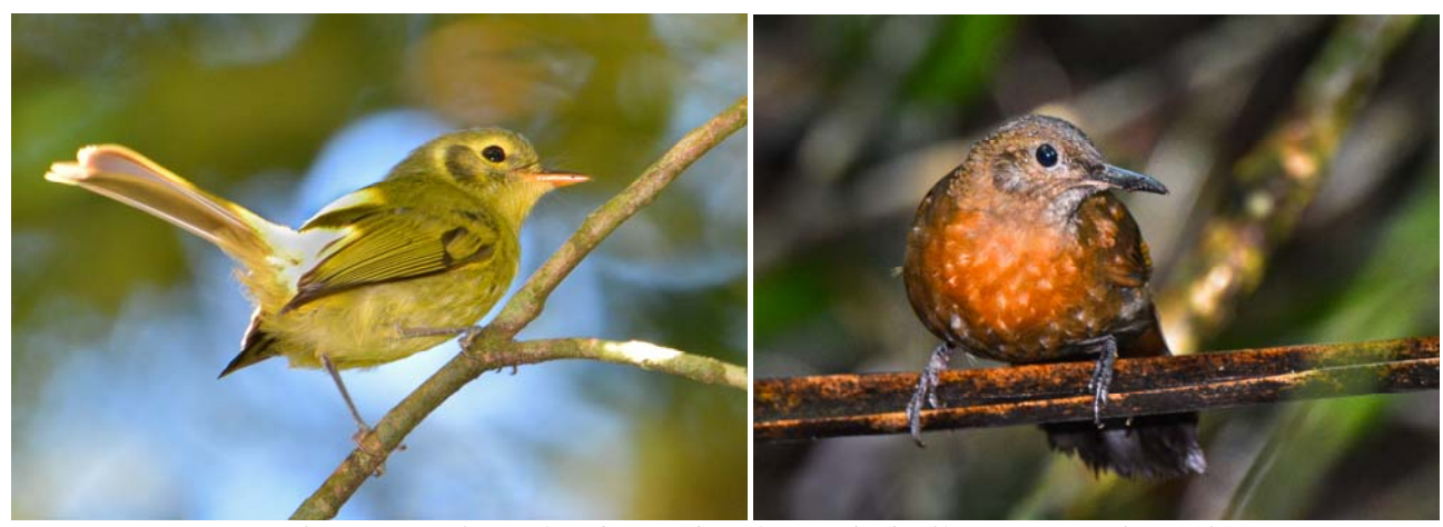
Oustalet's Tyrannulet; Rufous-breasted Leaftosser [both Elfin Forest ('Red') Trail]