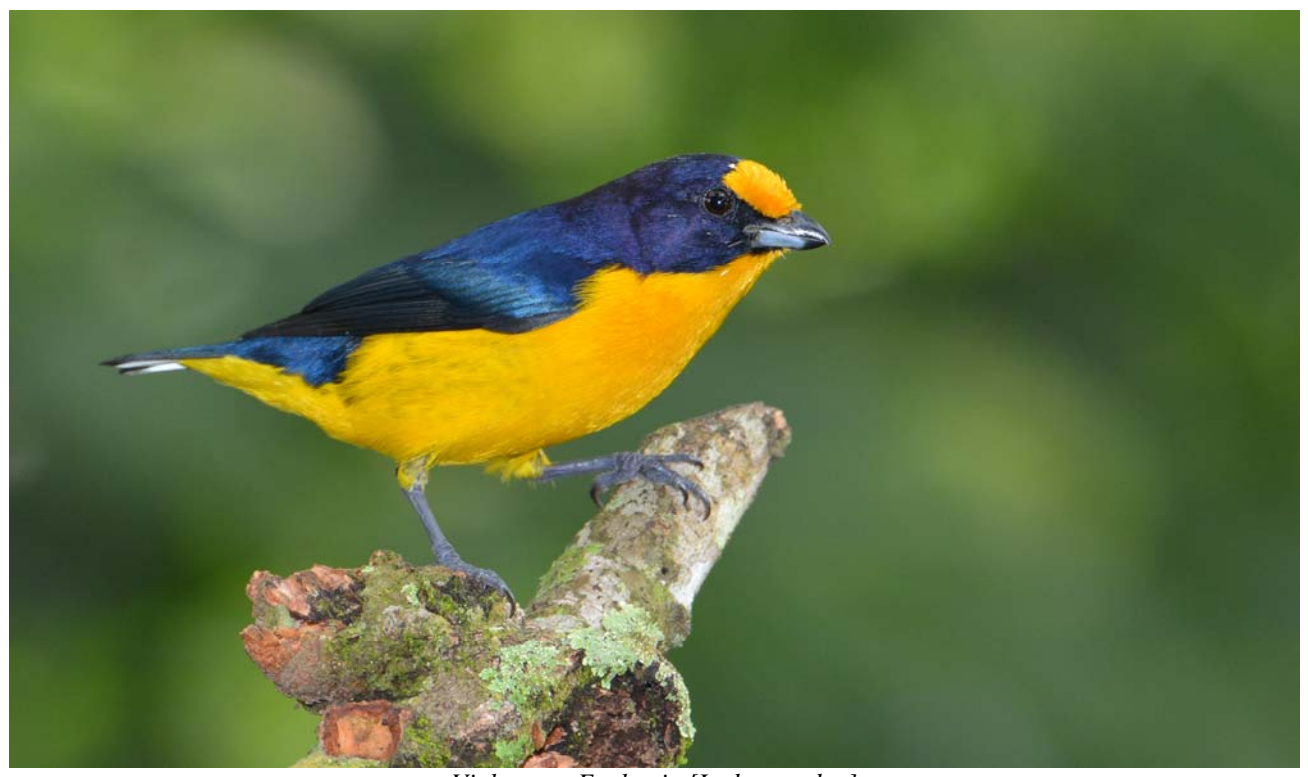
Violaceous Euphonia [Lodge garden]