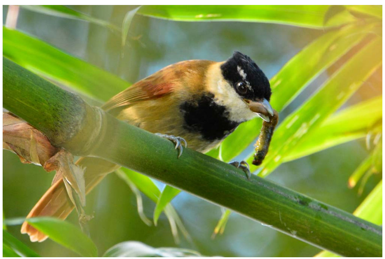
White-bearded Antshrike [Elfin Forest ('Red') Trail]

Local guide Adilei helped find a Giant Snipe on my first evening – it put on a great show for us just after dusk as it flew low around an open field and then crouched down in the grass where we were able to enjoy excellent spotlight views. The following day, Adilei guided me on the Elfin Forest ('Red') Trail that extends up through primary forest from the Waterfall ('Green') Trail that I had birded back in April. During this full day of birding, we hiked some 12km (round-trip) and gained over 800m. The trail topped out at exactly 1000m ASL where we enjoyed lunch with spectacular views from the ridgeline elfin forest. Highlights along the Elfin Forest Trail included seeing a Sharpbill (finally!, albeit high in the canopy) and securing good views of lifers such as White-bearded Antshrike (in bamboo just before the top of the trail) and White-bibbed Antbird (in the eponymous elfin forest at the very top of the trail).