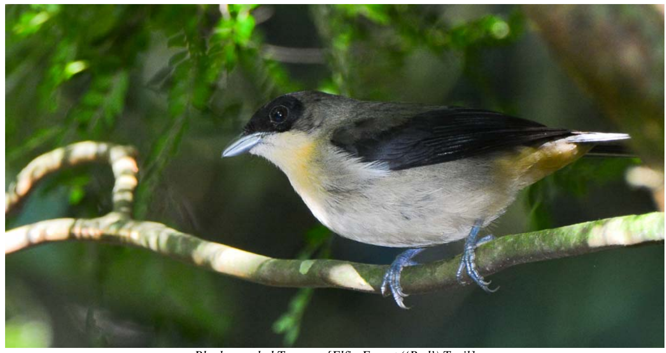
Black-goggled Tanager [Elfin Forest ('Red') Trail]