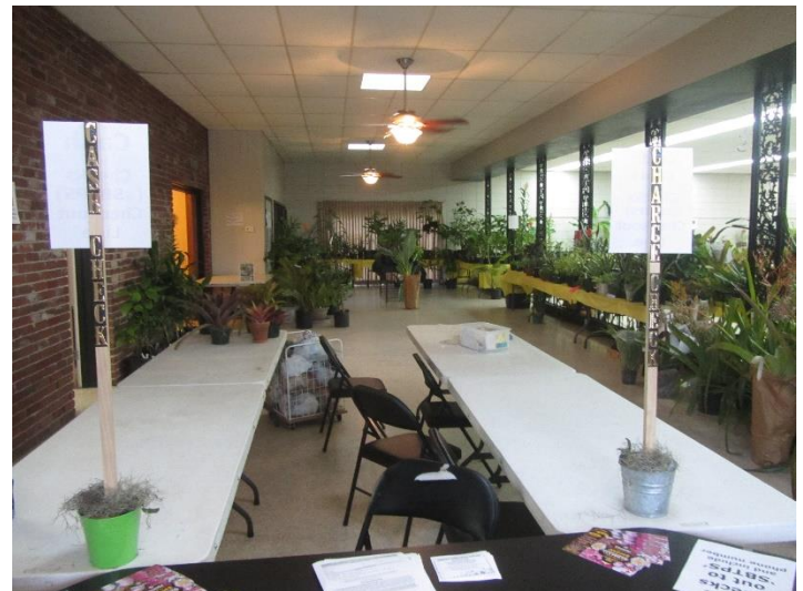
Two Checkout Locations