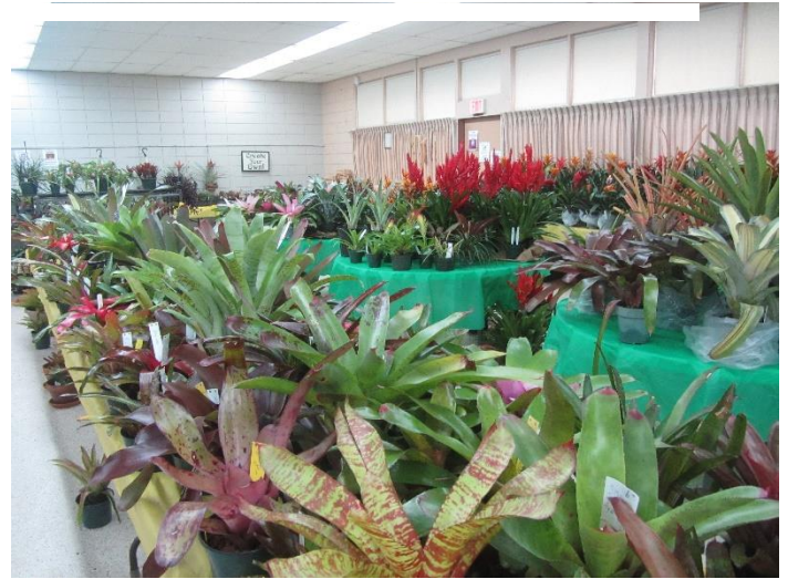
A Great Selection at the Fall Plant Sale