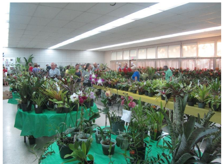
Saturday Morning Shoppers