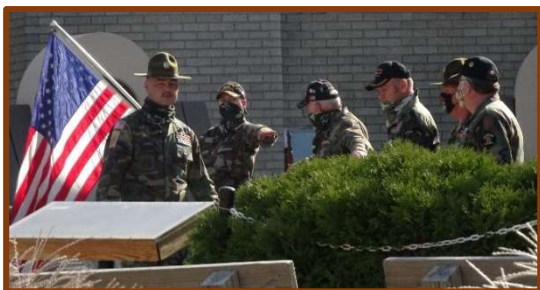
The VFW 7872 from the Town of Manlius provided a color guard and a 21-gun salute.