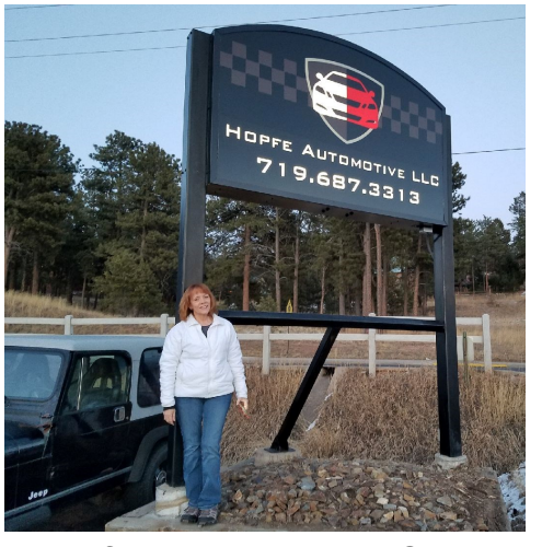
Hopfe Automotive LLC 570 E Chester Ave Woodland Park CO 80863

4496 Austin Bluffs Pkwy, Colorado Springs CO 80918 719-373-1549