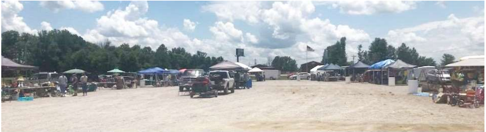
Vendors setting up at the Tollesboro Lions Club Fairgrounds displaying and selling their wares on a beautiful day during a recent Trade Days event.

The TOLLESBORO LIONS CLUB would like to thank all of our supporters and sponsors, as well as all of the persons who volunteer their time to aid the Club in putting on the fair as well as assisting us with our service projects. We couldn't accomplish all that we have done and continue to do without the generous support of our friends and neighbors, sponsors and supporters.