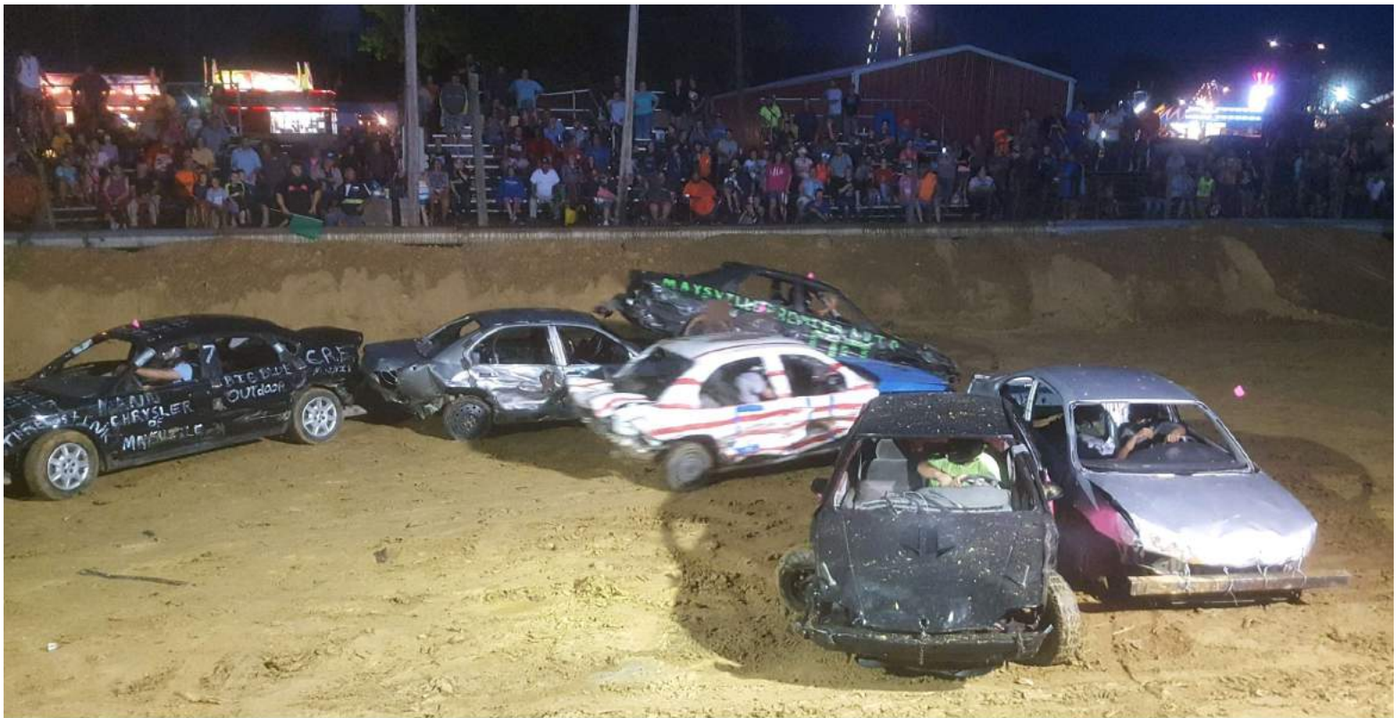
Compact Car Class of the Demolition Derby in one of the Heat Races (the winners of the event are not included in this photo). The car in the background on top of the hood of another car is the eventual "Mad Dog" Trophy winner, chosen after the Feature Race. The car at the far left was the raffle car driven by a member of the crowd who just happened to purchase the winning raffle ticket to permit him to drive this car in the event and who put on a good show for those in the crowd cheering him on.