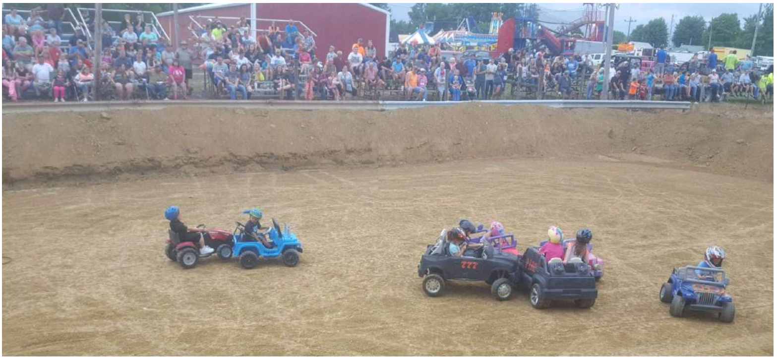
9 Participants (very young children) in 7 battery powered vehicles competed in the POWER WHEELS DEMOLITION DERBY Monday July 16th at the Tollesboro Lions Club. All of these young brave children tried their best, captivating the crowd and putting on an entertaining and enjoyable show for the huge crowd to watch.