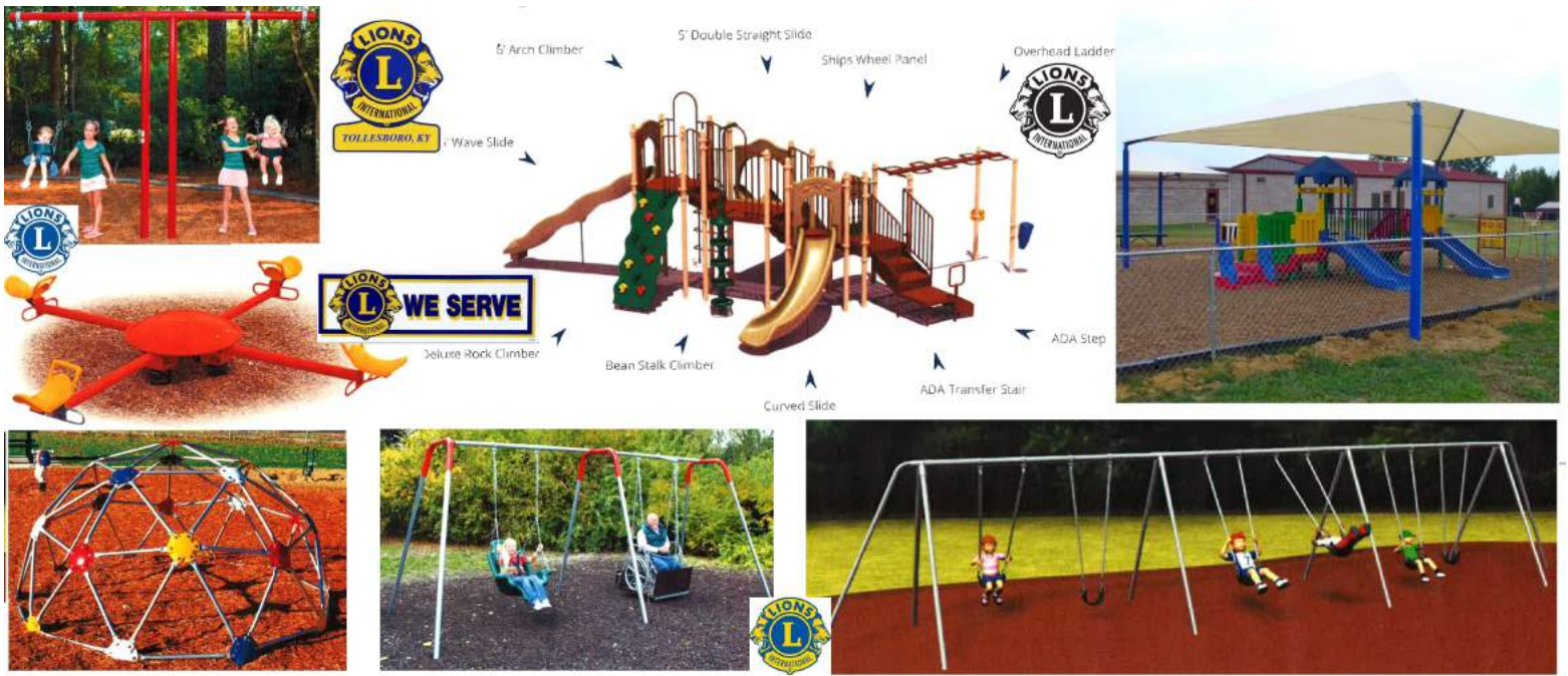
PHOTO SHOWING THE PLAYGROUND EQUIPMENT TO BE PLACED AT THE TOLLESBORO LIONS CLUB FAIRGROUNDS.