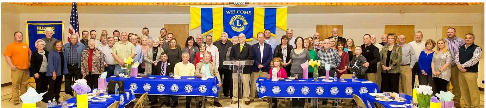
Photo showing members and guests present at the Tollesboro Lions Club Awards Banquet, Mar. 26, 2018