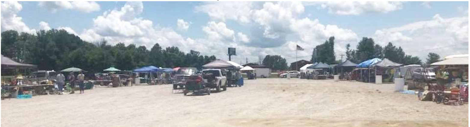
Vendors setting up at the Tollesboro Lions Club Fairgrounds displaying and selling their wares on a beautiful day during a recent Trade Days event.

The Tollesboro Lions Club would like to invite everyone to attend this fall event.