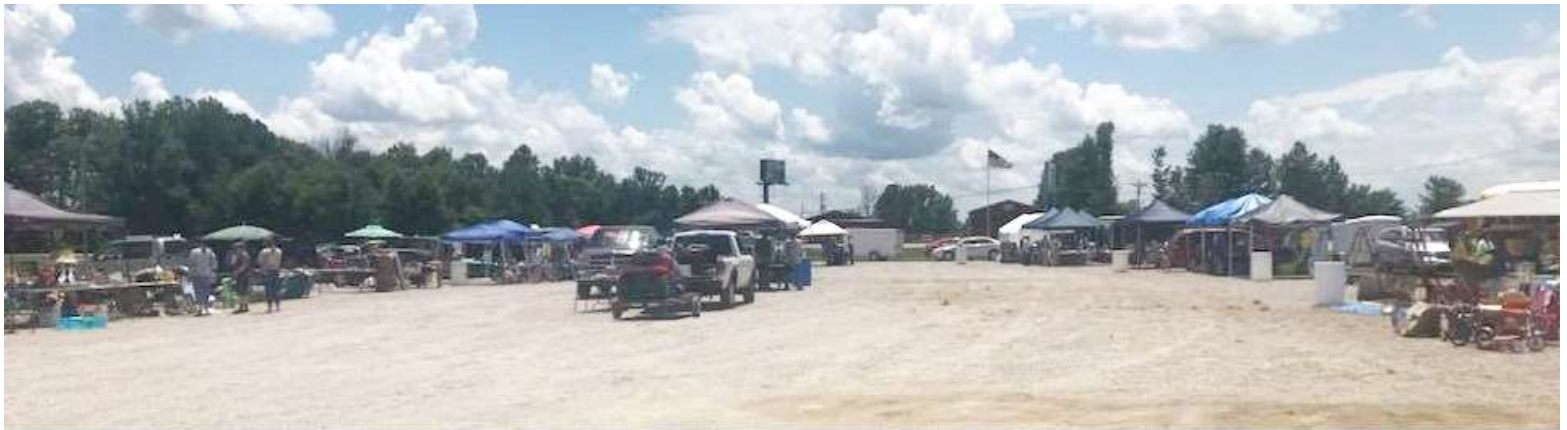
Vendors setting up at the Tollesboro Lions Club Fairgrounds displaying and selling their wares on a beautiful day during a recent Trade Days event.

NOTE: Every candidate for state and local office was sent a professionally printed postcard invitation to attend this event, whether opposed or not.