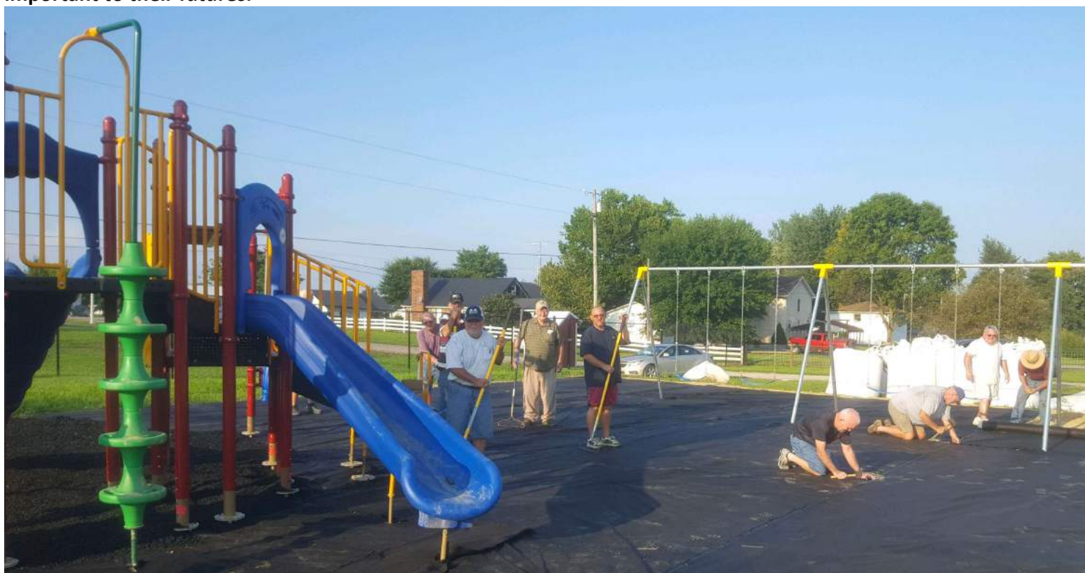
Tollesboro Lions Club members "Work Night" installing filter fabric and mulch on new playground.

The Tollesboro Lions Club is very pleased that we have been able to provide support to a large number of students over the years, and plan to continue offering such support in the future to local youth as education is so important to their futures.