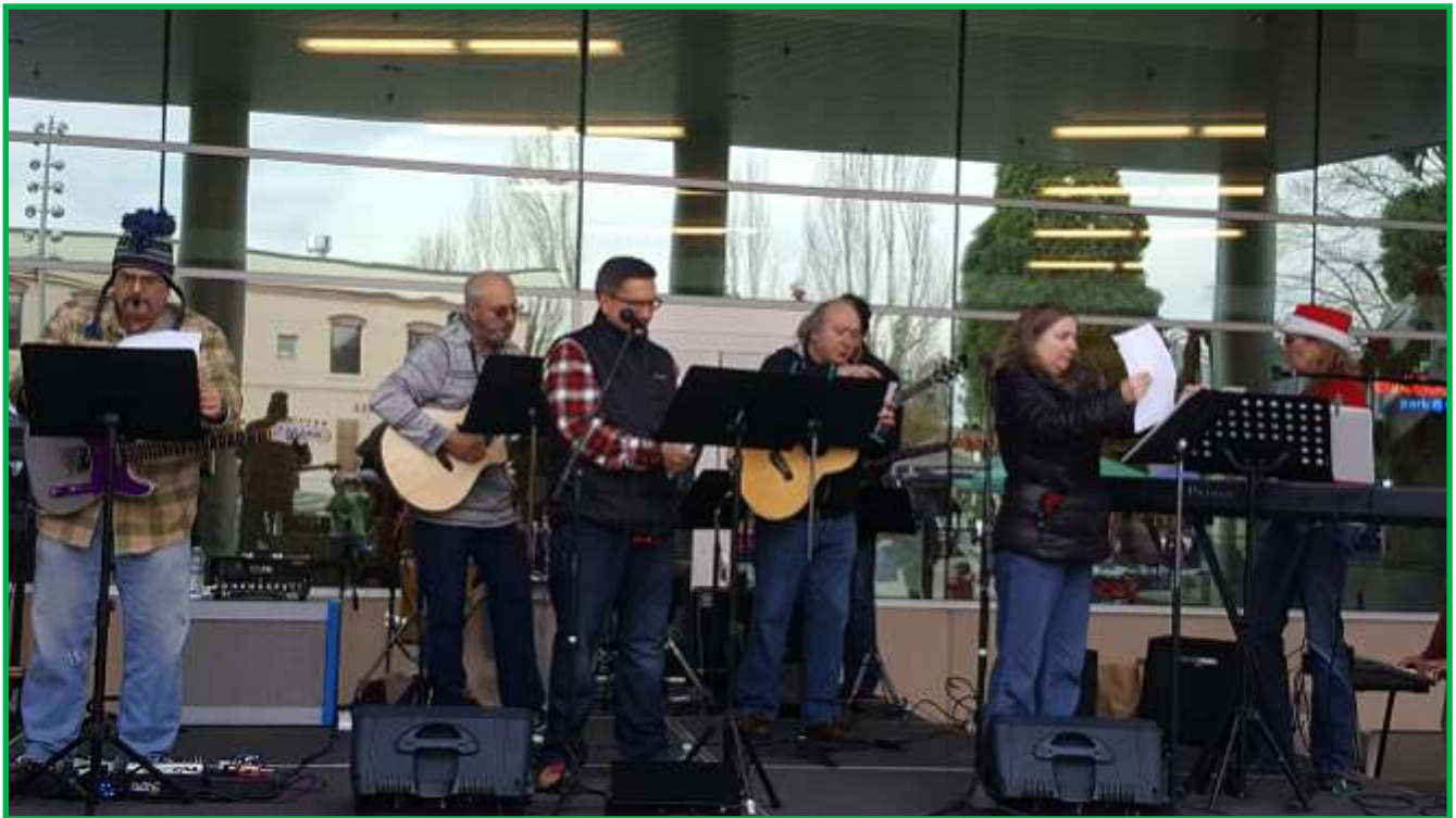
Calvary's Band playing at Hillsboro Happy Holly Days last Saturday!