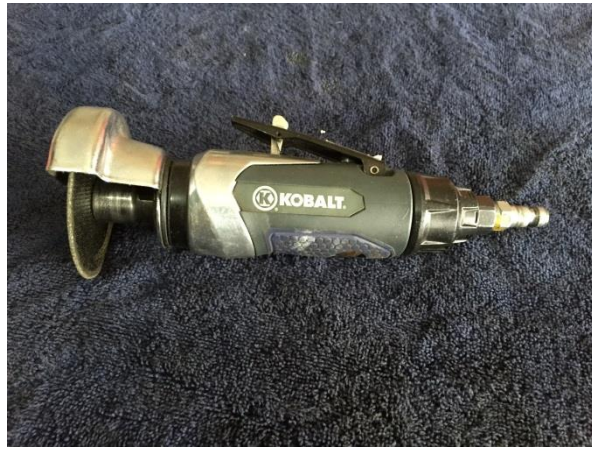
Kobalt Cutoff Tool: It's OK