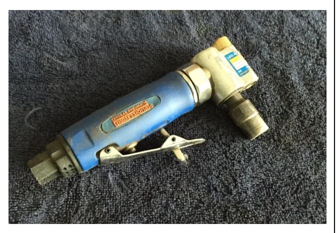
Harbor Freight Air Tool: Don't Bother

The Ingersol Rand angle die grinder is a real workhorse. I go through boxes of the Roloc discs for smoothing welds on sheet