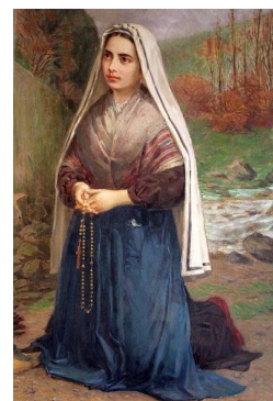
Feast Day: April 16

During her life, Bernadette suffered much. She was hounded by the public as well as by civic officials until at last she was protected in a convent of nuns. Five years later, she petitioned to enter the Sisters of Notre Dame of Nevers. After a period of illness she was able to make the journey from Lourdes and enter the novitiate. But within four months of her arrival she was given the last rites of the Church and allowed to profess her vows. She recovered enough to become infirmarian and then sacristan, but chronic health problems persisted. She died on April 16, 1879, at the age of 35. Bernadette Soubirous was canonized in 1933. She is the patron saint of illness, against poverty, and people ridiculed for their faith.