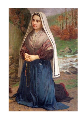
Feast Day: April 16

Few visions have ever undergone the scrutiny that these appearances of the Immaculate Virgin were subject to. Lourdes became one of the most popular Marian shrines in the world, attracting millions of visitors. Miracles were reported at the shrine and in the waters of the spring. After thorough investigation, Church authorities confirmed the authenticity of the apparitions in 1862.