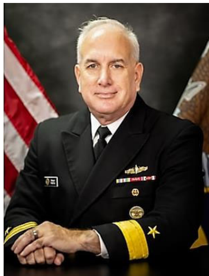
Rear Admiral Phillip E. Sobeck Commander of the Military Sealift Command of the U.S. Navy