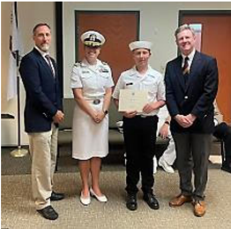
Cadet Little promoted to LC2 (League Cadet).