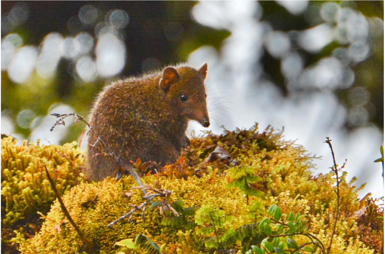
Speckled Dasyure [Tari valley]