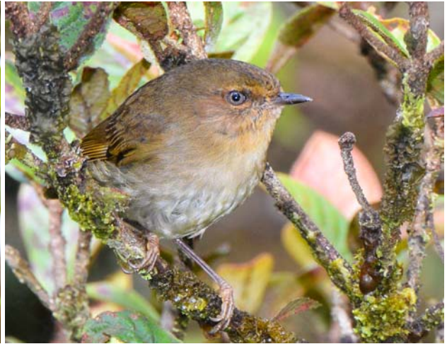
Papuan Grassbird; Papuan Scrubwren [both Tari valley]