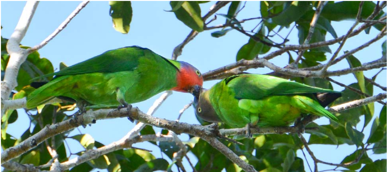
Red-cheeked Parrots [Varirata National Park]