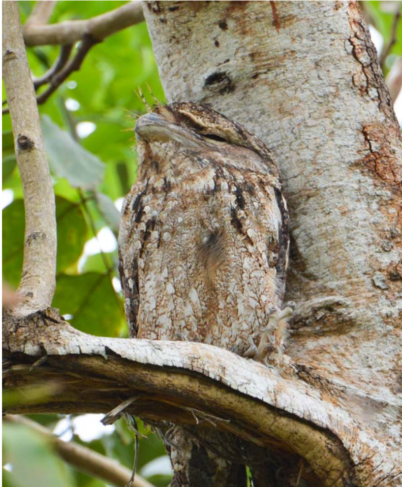
Papuan Frogmouth