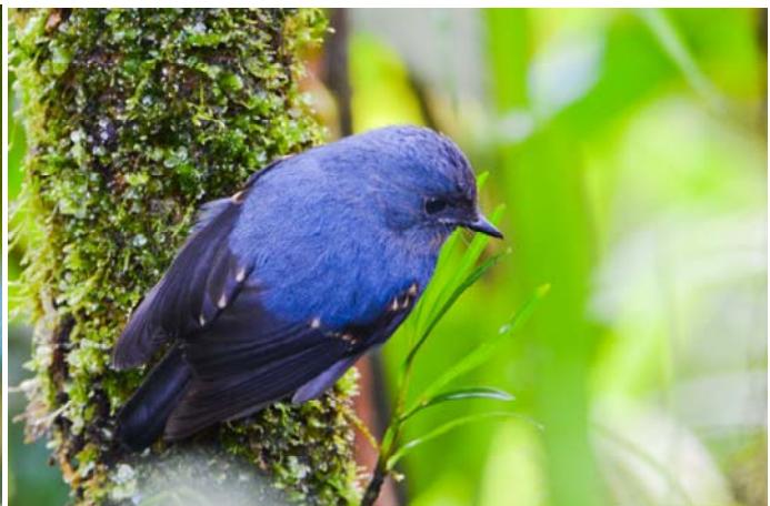
Black-breasted Boatbill [Tari valley]; Blue-Gray Robin (immature) [Ambua Lodge]