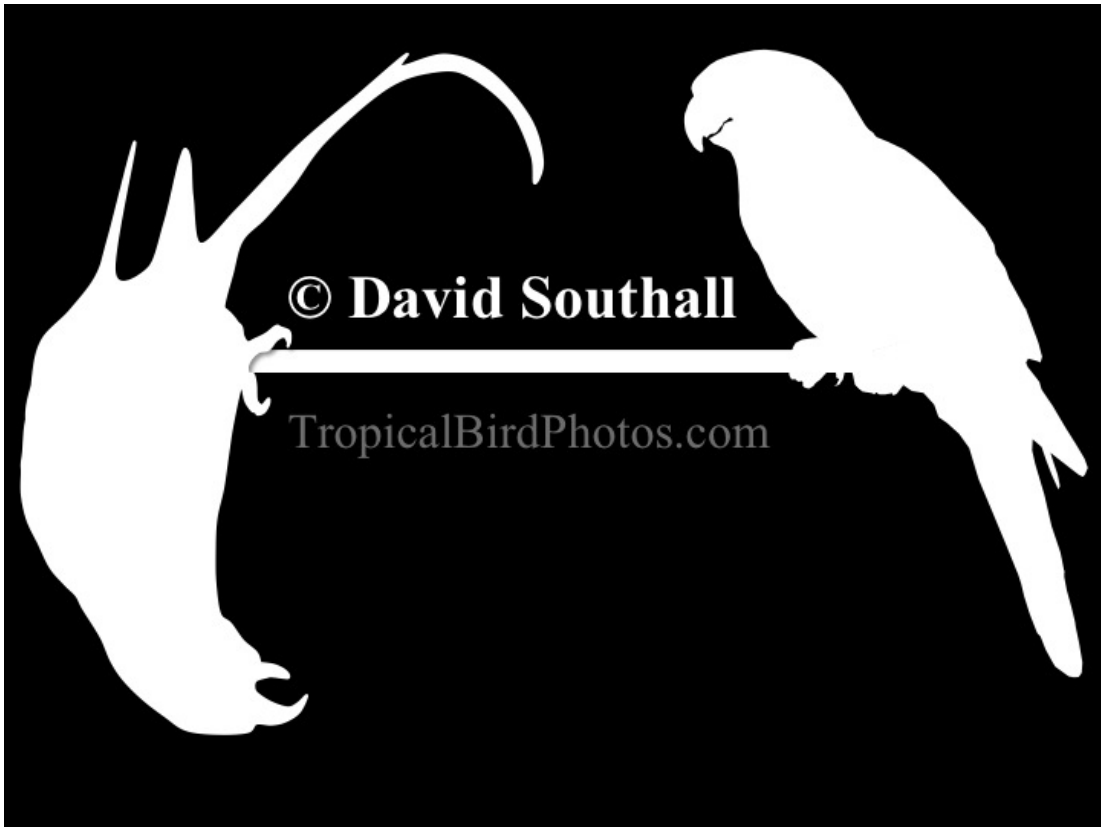
New logos incorporating Psittacidae from Australasia (left) and the Neotropics (right)