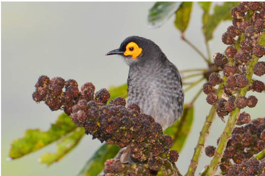
Smoky Honeyeater [Ambua Lodge]