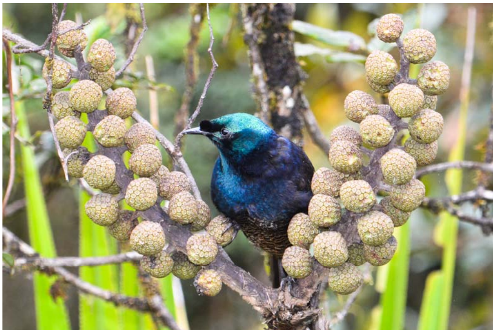
Ribbon-tailed Astrapia (female) [Tari valley]