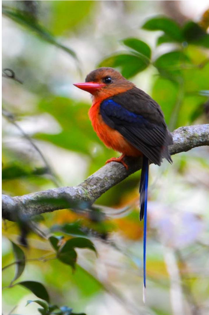
Brown-headed Paradise-Kingfisher [Varirata National Park]