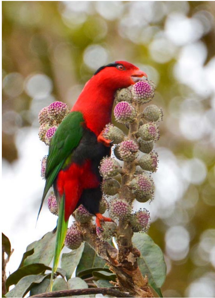
Papuan Lorikeet [Tari valley]