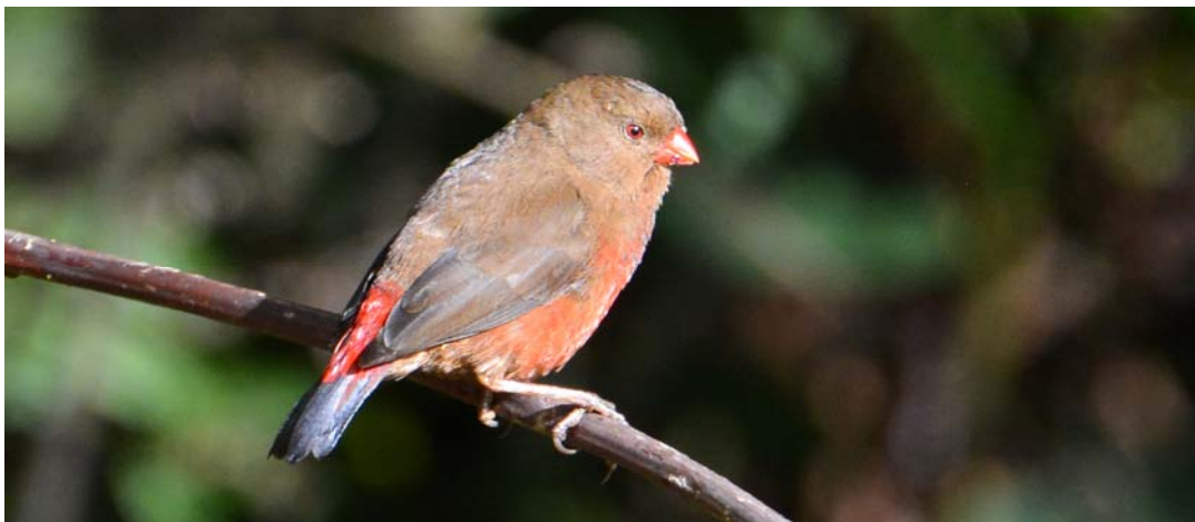
Mountain Firetail [Tari Gap]