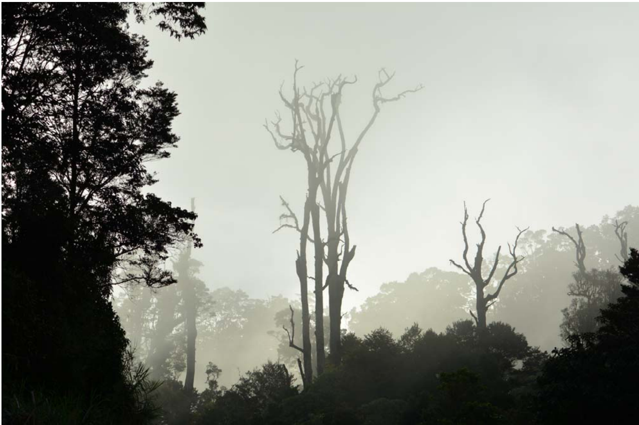
Mist shrouded monuments to a section of forest lost below Tari Gap