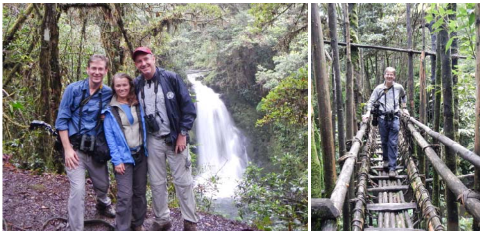
One of the thundering waterfalls along Ambua Lodge's 'Three Bridges' trail; All natural suspension bridge

Lesser Black Whipsnake ( Demansia vestigiata ) [V]: