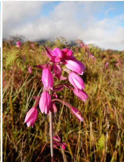
The beauty of the savannah and forest at orchid-strewn Tari Gap