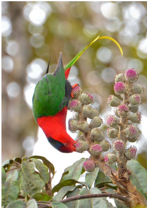
Papuan Lorikeet [Tari valley]

The lodge's 'Three Bridges' trail was the only extensive forest trail that we had access to in the Tari valley, and it proved productive for a range of forest species. The full circuit took some two plus hours at birding pace and highlights included glimpses of a Spotted Jewel-Babbler that David M-K tempted to approach us, a Papuan Treecreeper embedded within a mixed flock, a rarely seen Black-billed Sicklebill working the mossy branches of a tall tree, a pair of Torrent-larks along a fast-flowing stream, a single Black Pitohui and several Short-tailed Paradigallas (at least one with a surprisingly long tail). The lodge gardens also delivered several birds-of-paradise visiting a large fruiting tree and multiple spot-light sightings of Jungle Hawk-Owls.