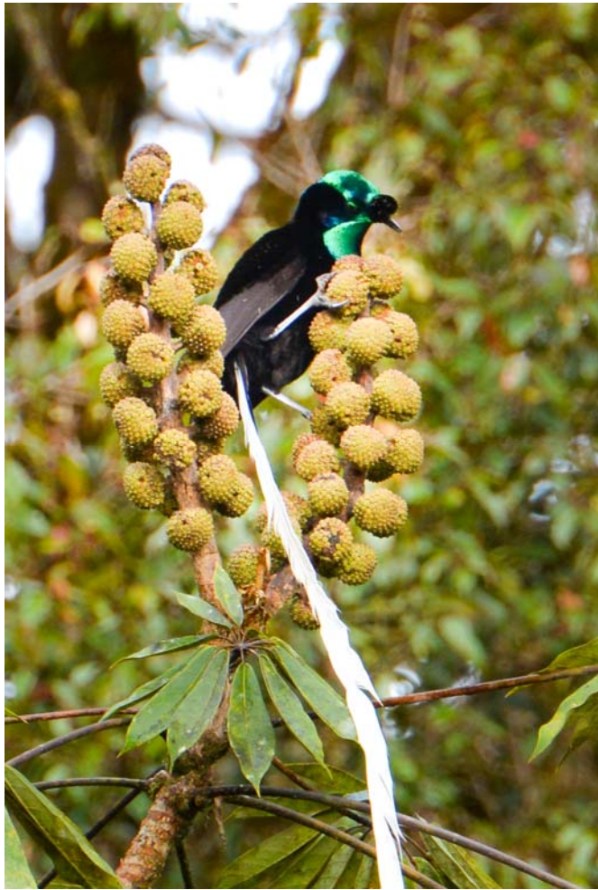
Ribbon-tailed Astrapia [Tari valley]