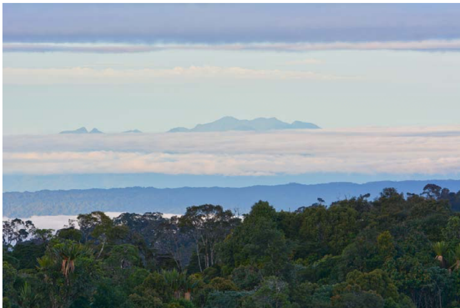
Dawn view from Tari Gap towards distant mountain ranges