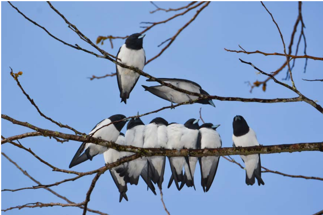
Great Woodswallows [Ambua Lodge]