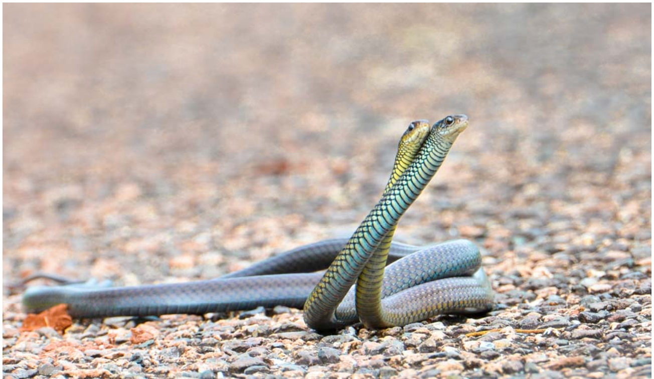
Lesser Black Whipsnakes [Varirata National Park]