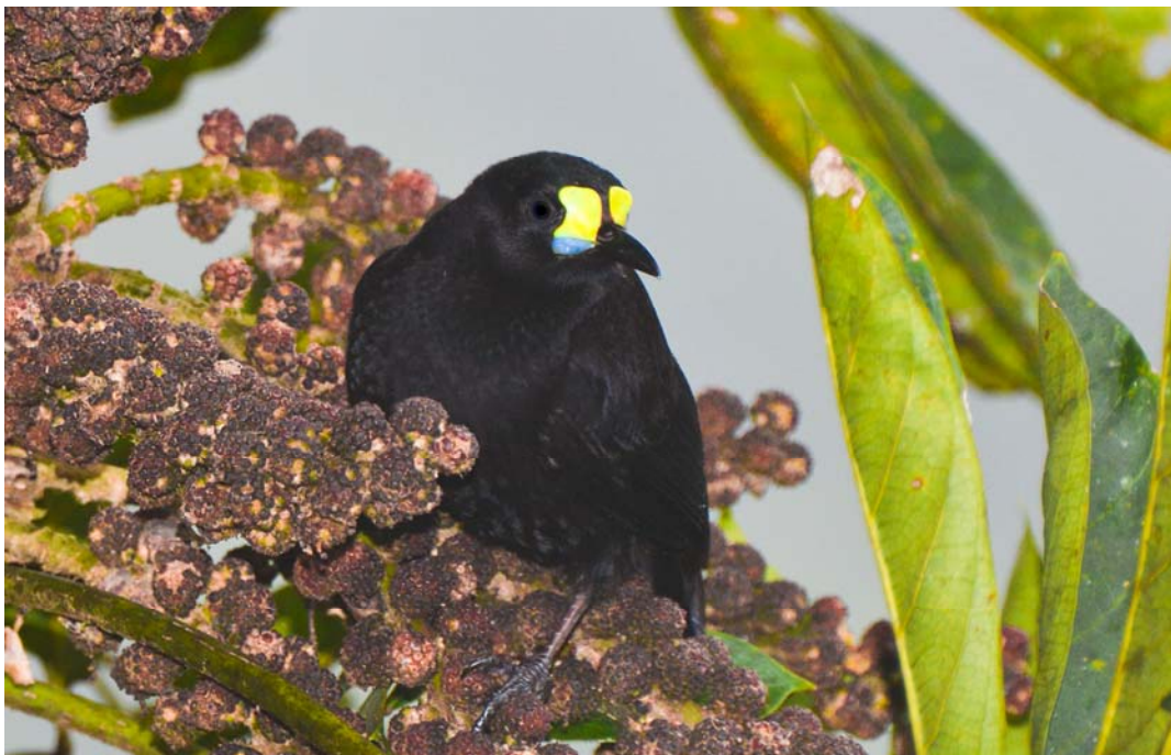
Short-tailed Paradigalla [Ambua Lodge]