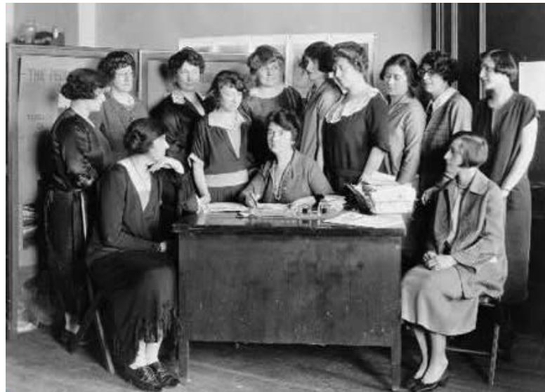
Margaret Sanger, seated, surrounded by staff members of the American birth Control League, ca. 1921

The American Birth Control League worked pointedly and actively to eliminate black Americans through the "Negro Project." Manipulating black leaders (including religious leaders) to help with this endeavor, Margaret Sanger once said, "We do not want the word to go out that we want to exterminate the Negro population, and the minister is the man who can straighten that idea out if it ever occurs to any of their more rebellious members." 8