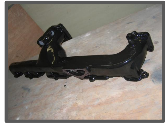
Post-repair and with new porcelain coating

The repair process involved magnafluxing the manifold to identify all cracks which may be in need of repair. They then secure the manifold to a fixture to ensure that it does not warp throughout the actual welding process. The manifold is placed in an oven and heated to cherry red (about 1200° F), and then cast iron is flowed into the repair areas. A lengthy cool down period follows the repair. After repair, the flange areas are machined.