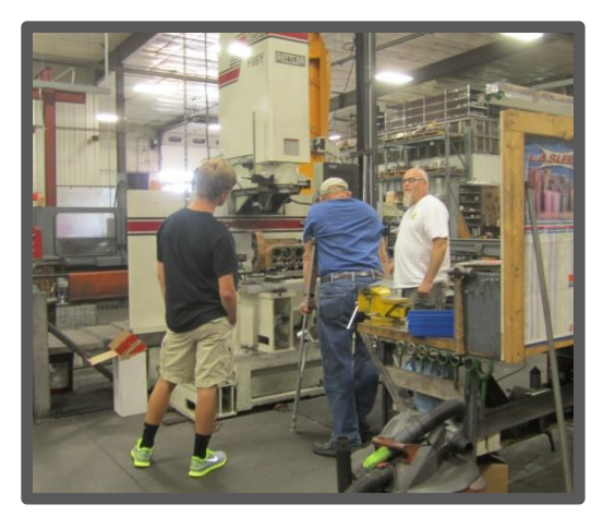
Midwest Cylinder Head Shop Tour

great shop which can do these repairs using cast iron, and successfully reporcelain the result. Call Midwest Cylinder Head and Machine in Nevada IA." And in this millennium of new media, they even are on YouTube!! Concerned about the ultimate result and the capabilities of Midwest, we decided to take the manifold to Iowa for a face-to-face and a shop tour... and after Galena, everybody needs (another?) road trip to Iowa!