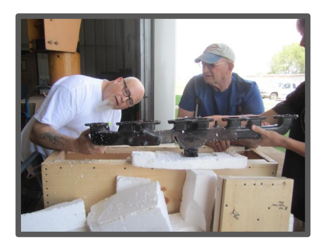
Manifold inspection in Nevada, IA