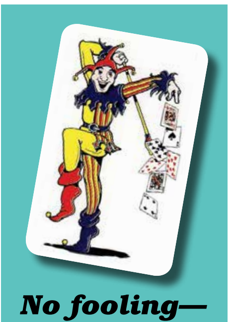
we effectively reach more