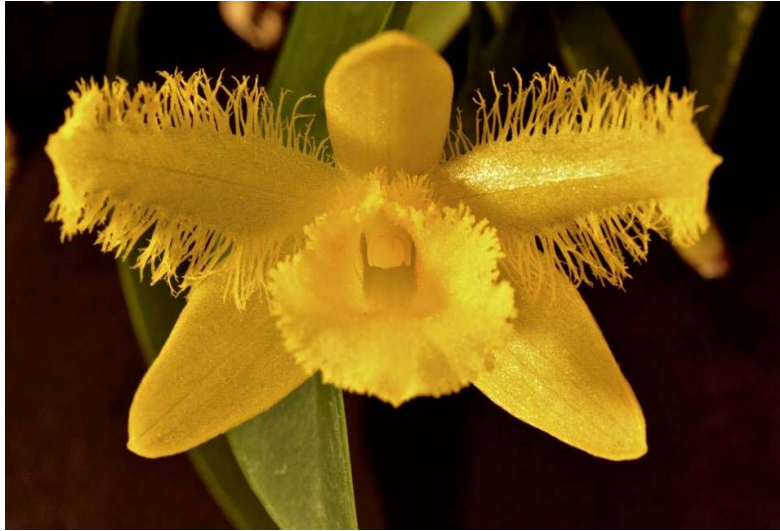
Dendrobium harveyanum