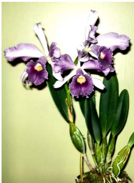
Lc. canhamiana coerulea 'Azure Skies'