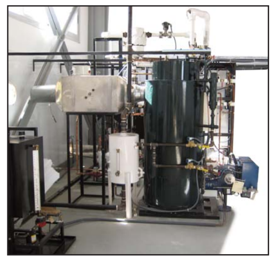
Model H-181A Steam Power Plant Trainer