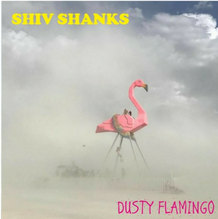
Dusty Flamingo (2019)

Contact: Shiv Shanks 1.403.347.5594 shivshanksmusic@gmail.com shivshanks.com