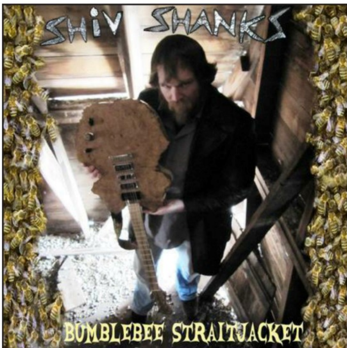
Bumblebee Straitjacket (2013)