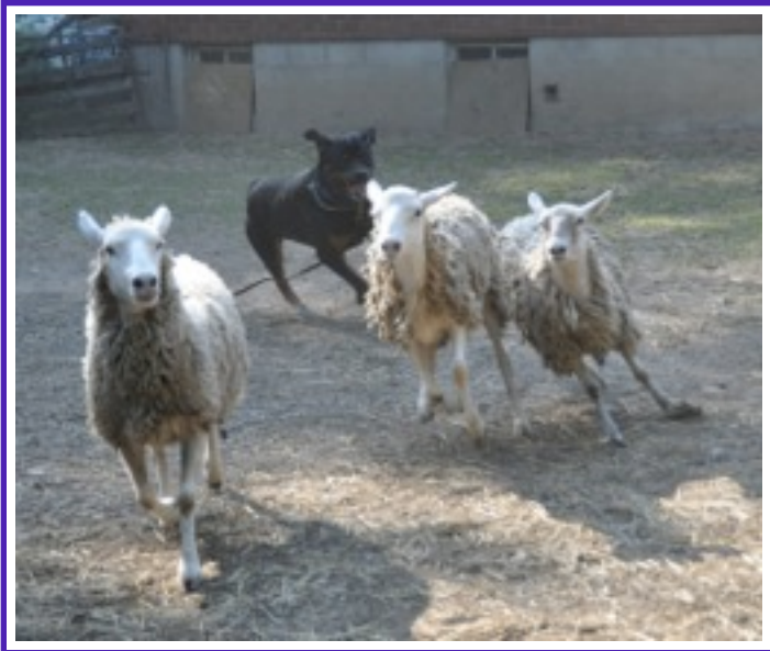
Andel's Back To The Future HIC (Ethan)