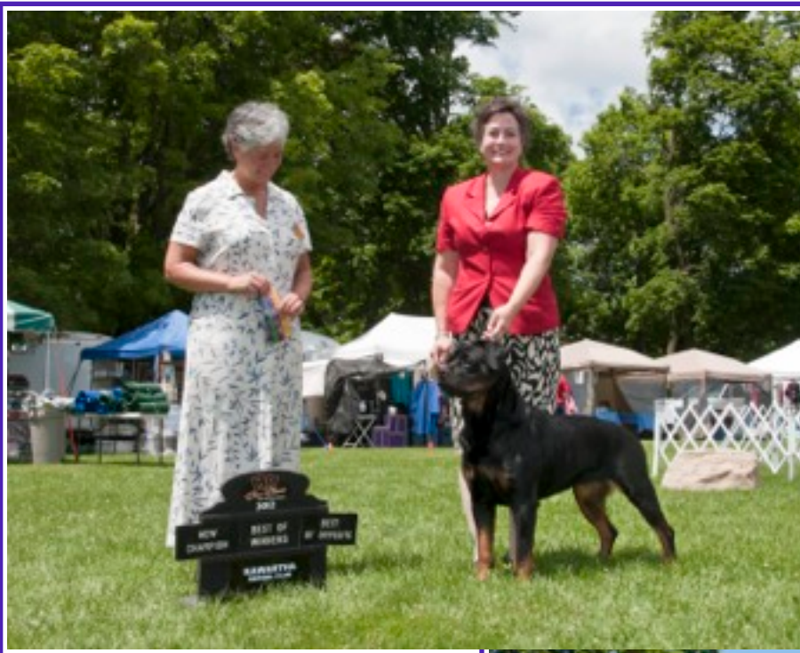
Am CH/new Can CH Esmonds Simply Meant To Be, HIC (Grace)