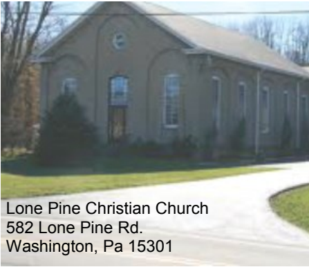
Lone Pine Christian Church 582 Lone Pine Rd. Washington, Pa 15301