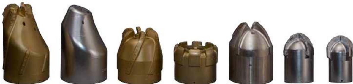
Full Selection of Casing Bit Nose Profiles