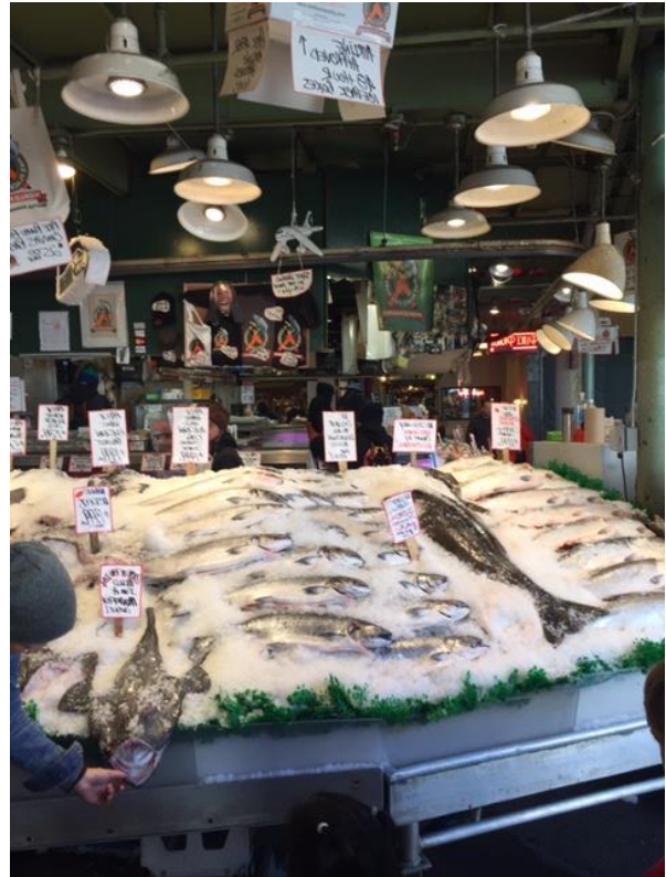
1 Pike Place, Seattle, Washington

My western adventure took me from Wyoming and South Dakota to Washington (my birth state), and now California, where I'm spending my last full day today. My final stop is in Texas. Other than a lot of journaling/writing and sight-seeing, I visited my god parents and family friends I hadn't seen in over 10 years. Fortunately everyone I've seen hasn't changed much, but we've all gotten older and our circumstances have changed. I do my best to relish seeing these people because as I've experienced with my ill grandmother, I never really know if I'll see them the way I used to again. Hopefully we all age gracefully, but sometimes it's not the case. The lesson I've learned is to make the most out of the things I love, hobbies I love and people I love. Do more of what makes me happy and be around more of the people who make me happy. I hope you can do the same. Pictures are below and more to come next time. Have a great week!