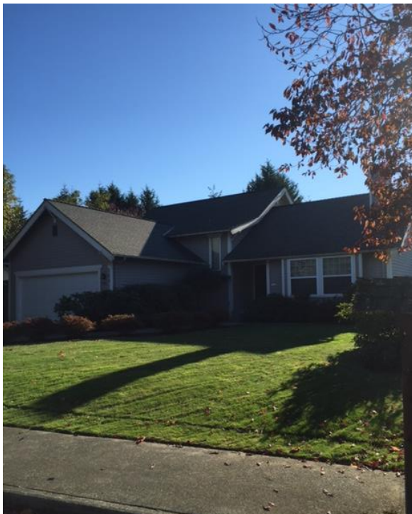
3 My birth home, Kirkland, Washington