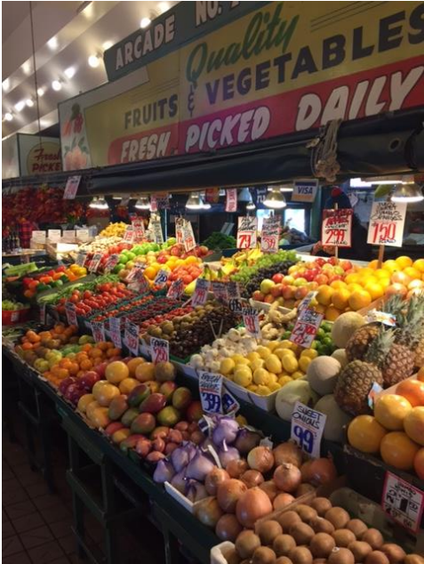
7 Pike Place, Seattle, Washington