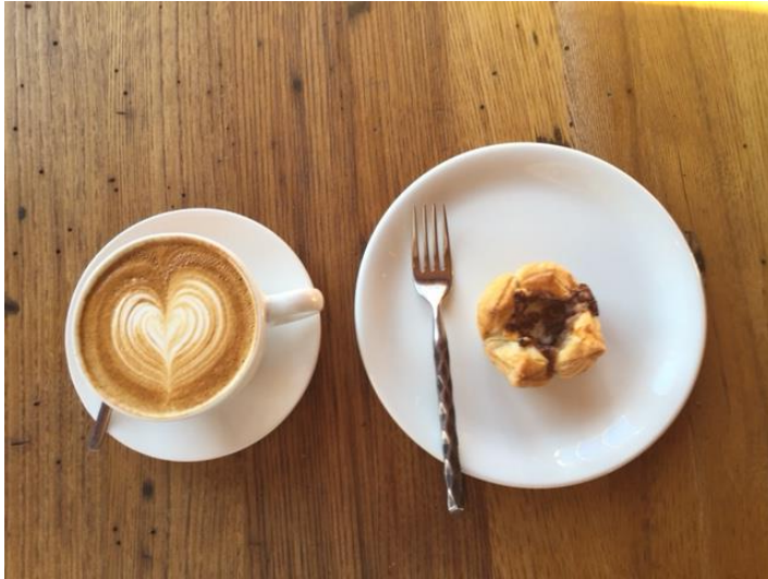
5 Storyville Coffee, Seattle, Washington