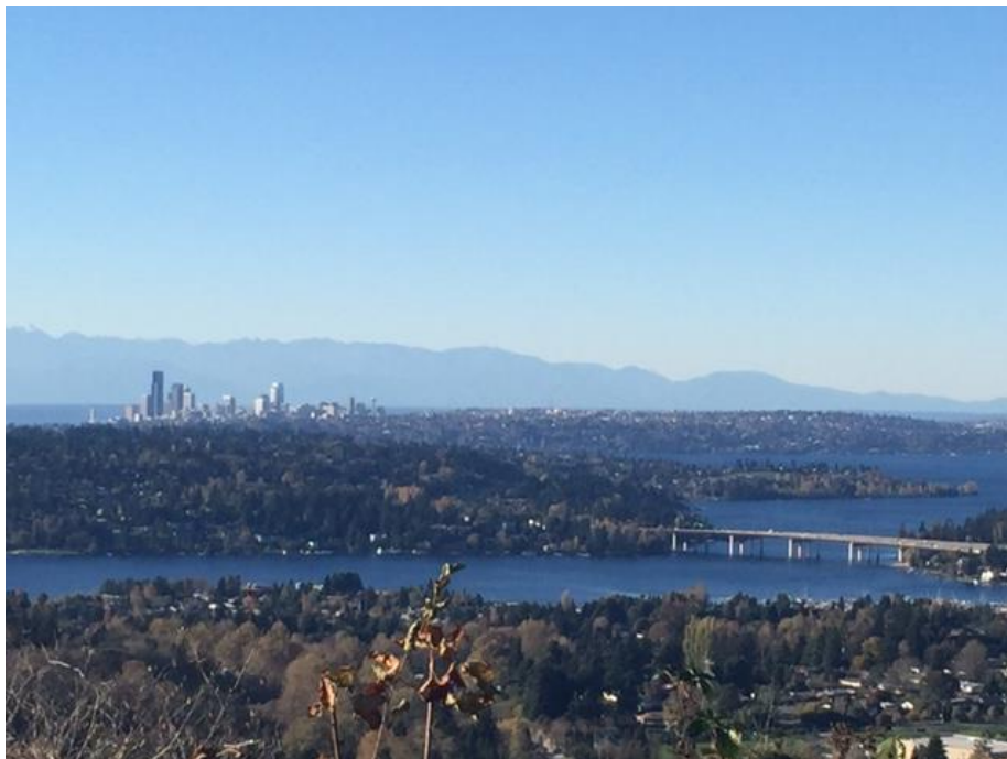
2 View of Seattle from Bellevue, Washington