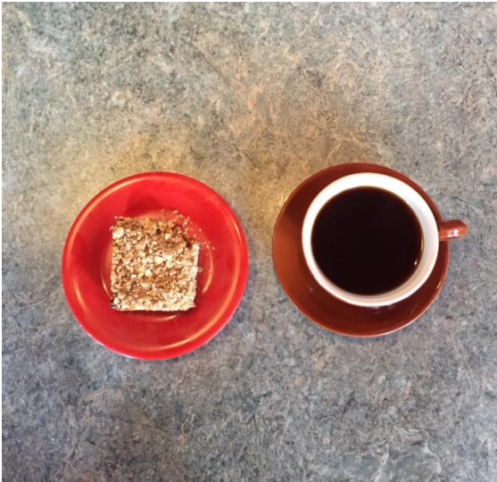
6 Red Rock Coffee, Mountain View, California