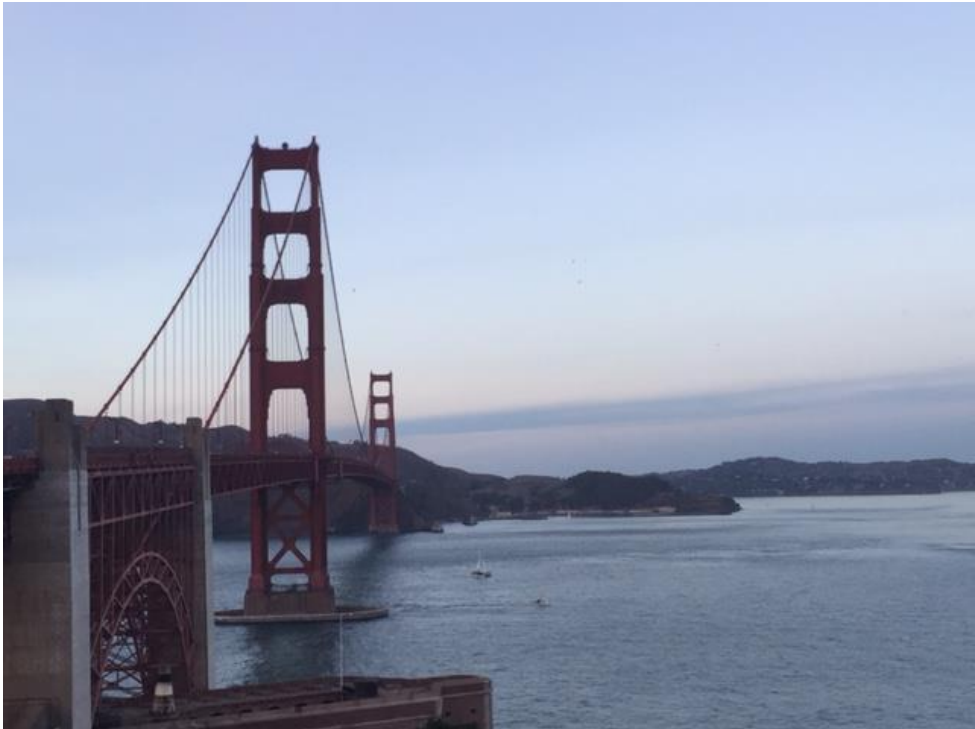
8 Golden Gate Bridge, San Francisco, California