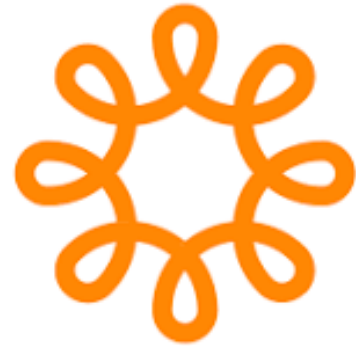
Wild Apricot Phone App Symbol