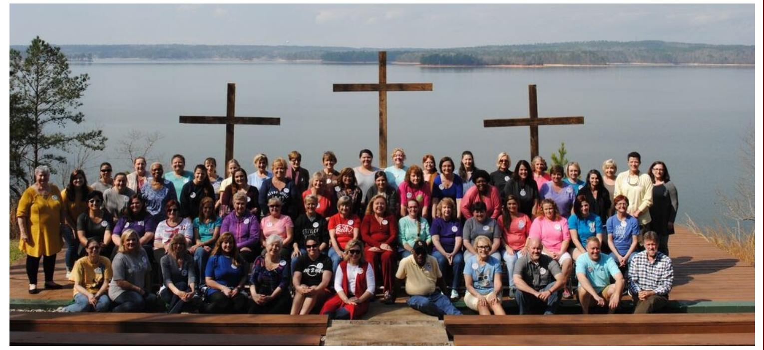
Welcome Women of CAEW Walk # 191