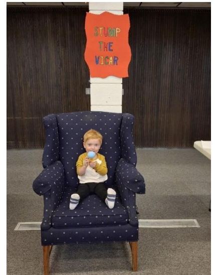
A Future Vicar 😊?