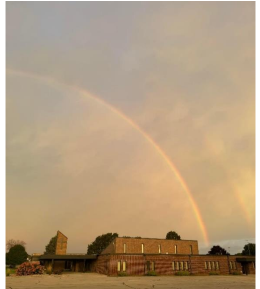
Beautiful double rainbow over church!