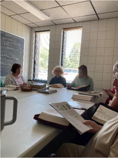
Esther Circle meeting in a Sunday School room while the electricity was out!