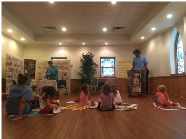
Our Pre-k class learns the story of Martha and Mary in the VBS Bible Story Station (picture left)