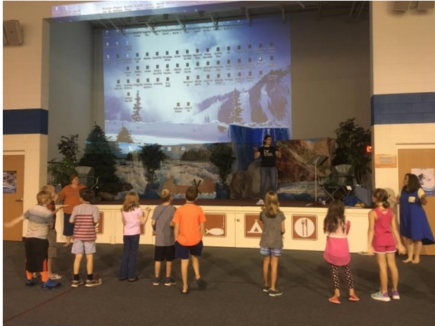
Our 2 nd and 3 rd grade class learns a song and dance in the VBS Music Station (picture left)