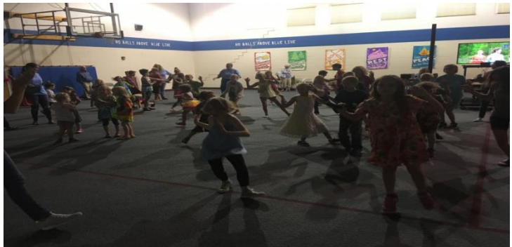
Grooving to the music at closing assembly (picture below)