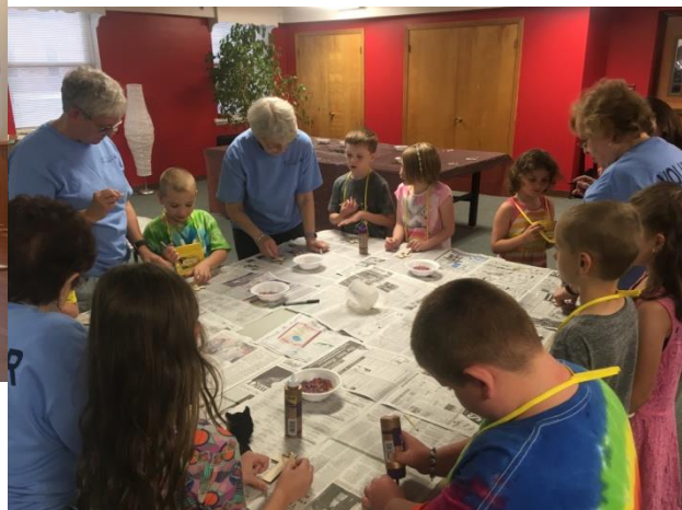
Our Kindergarten and First grade class decorates wooden cross magnets in the VBS Craft Station (picture right)