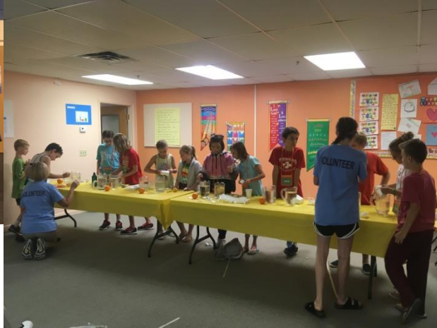
Our 4 th and 5 th grade class participates in a buoyancy experiment in the VBS Science Station (picture right)