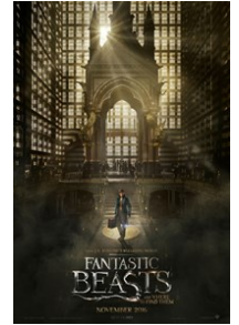
FANTASTIC BEASTS AND WHERE TO FIND THEM 11/26 & 11/29