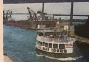
Soo Locks Cruise in Sault Sainte Marie