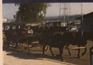
Tour Mackinac Island by Horse and Carriage

Diamond Tours inc. Bringing Group Travel to a Higher Standard ®