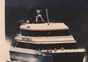
Mackinac Island Ferry