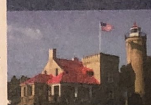
Mackinac Point Lighthouse