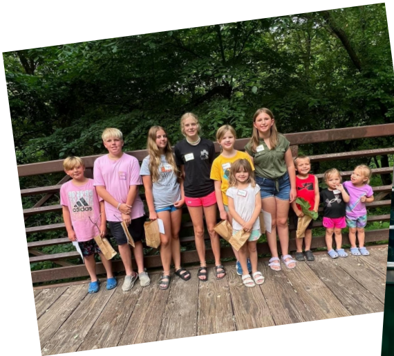
(Camp photos from last year)