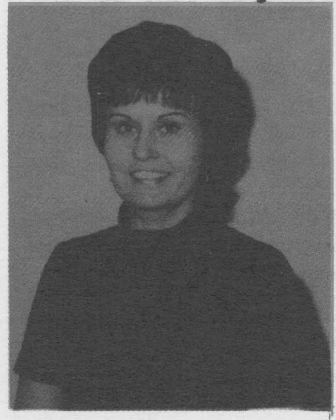
Child and Youth Evangelism