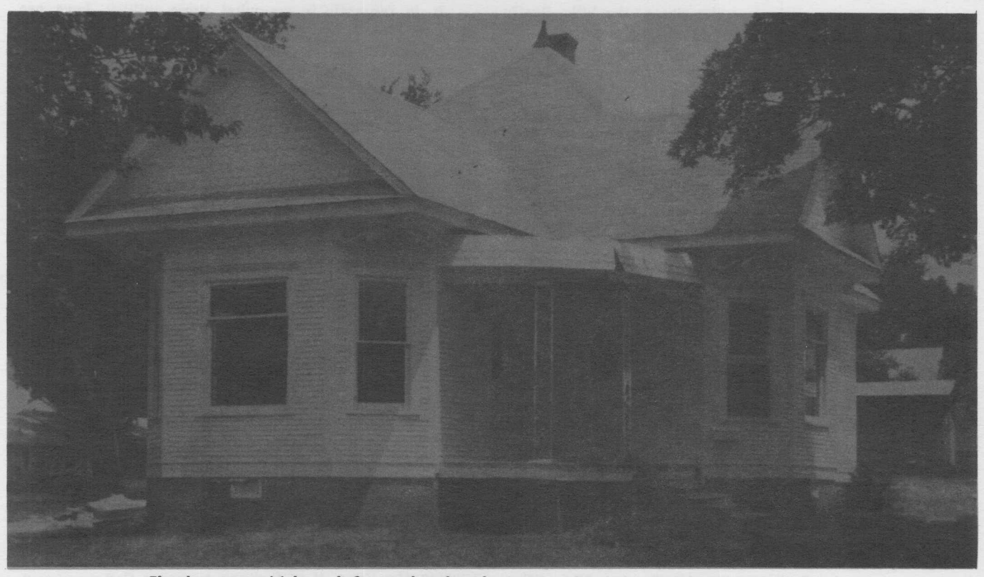
The house at 11th and Grant that has been completely remodeled for faculty.

Non Profit Organization U. S. POSTAGE PAID PERMIT No. 37 Galena, Kansas 66739