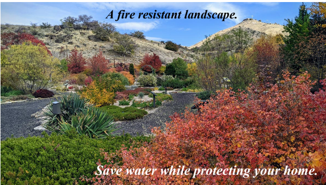
A fire resistant landscape.

Get your morning walk in and make a difference! Join us from 9:00 to 10:00 am at City Hall for a downtown trash pickup.