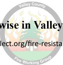
Save water while protecting your home.