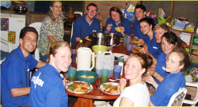
Storm Team from UK fun , games and loving Jesus !!