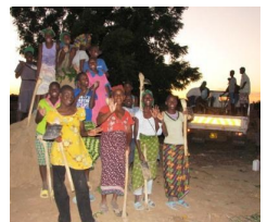
Pictures showing loading compost at TMC then unloading it at the new Village Project site and some of the children and staff with hoes clearing, planting maize (corn) then peanuts and beans between the maize stations and soon weeding....we hope...!O/

Maize Costs over double please see bottom of page eight