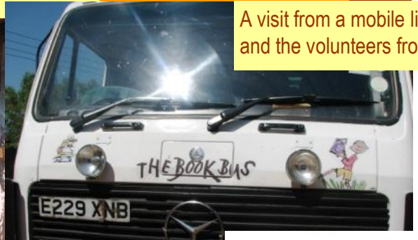
A visit from a mobile library and the volunteers from UK