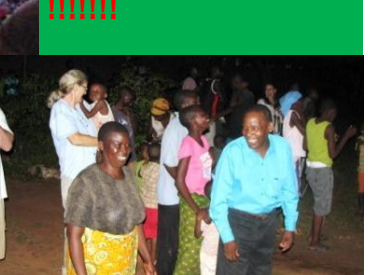
Watching Fire works