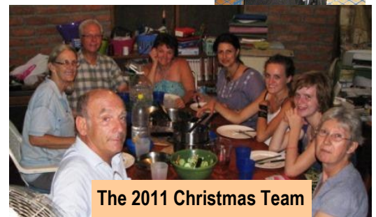
The 2011 Christmas Team

not able to answer the need over time. So what a relief to see it completed !!!