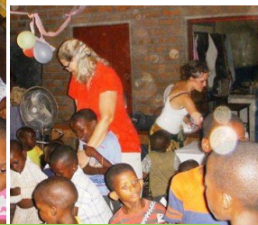
Christmas 2011 \O/