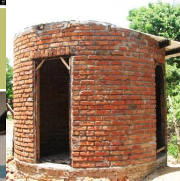
Another compost four chambered drop toilet almost ready ... not pretty but so important !!!!