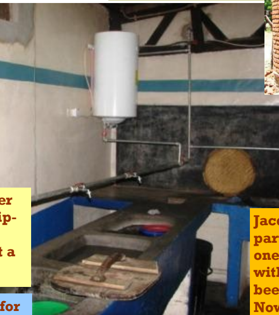
New Hot Water Heater and piping in main Kitchen What a blessing!!!!