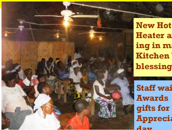
Staff waiting for Awards and gifts for Staff Appreciation day.