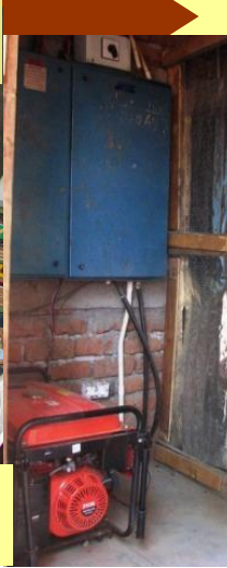
New Generator and change switch WOW !!