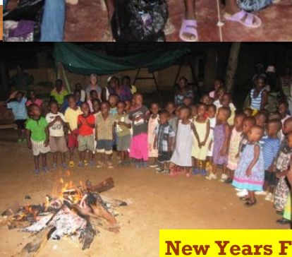
New Years Fire dance