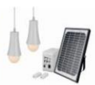
Small Solar Panels for homes