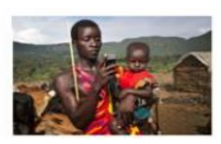
charging points for mobile phones