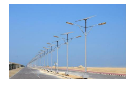
Solar PV LED Street Lighting