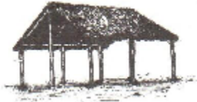
The Congregation's 1 st Church

June 5 weather permitting we will journey to the first site of Palestine Lutheran Church (plans are still underway for this – Palestine's 161 st birthday will be June 7) June 9-11 Confirmation group trip to Chicago June 13-16 Vacation Bible School