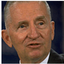
H. Ross Perot

The machinations surrounding the presidential candidates are daily becoming more intriguing. It just didn't seem possible that Perot would have dropped out of the race, particularly when he was on top in the polls. We here at Christian Crusade for Truth missed the analysis on his candidacy completely, for which we must apologize.