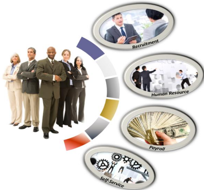
GoMyHR Solution Overview

Human resource department plays as core function roles in all business to ensure talent retention and organization development. Therefore, it is crucial for business to have an ideal solution to manage human resource operation with further analytics capability.